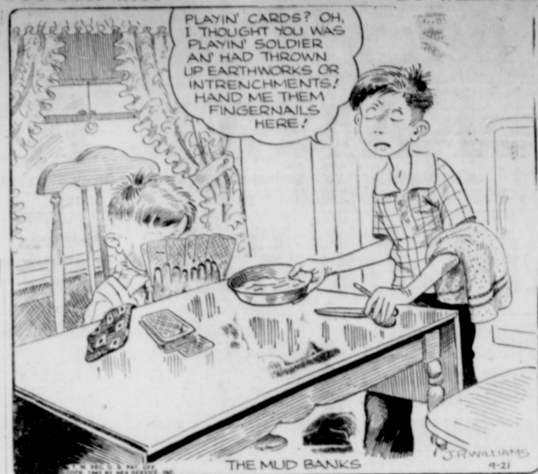
THE MUD BANKS About 40 per cent of British production comes from small work shops.