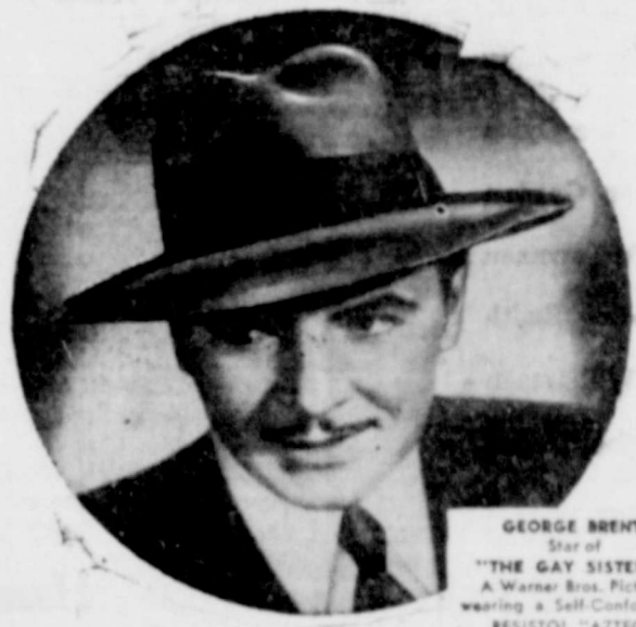
GEORGE BRENT Star of "THE GAY SISTERS" A Warner Bros. Picture wearing a Self-Conforming RESISTOL "AZTEC"

Men who want something really smart, go for this unusual attractive "AZTEC" model. Its rich appearance is enhanced by the specially wide bound edge. And the exclusive Resistol Self-Conforming feature provides comfort equal to its good looks.