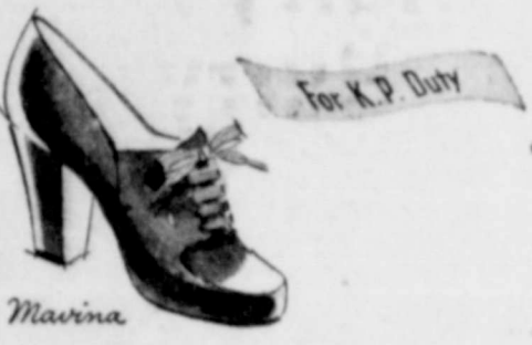
Marina This gallant little tie with square heel and toe does wonders for your feet, works wonders with your shoe coupon!