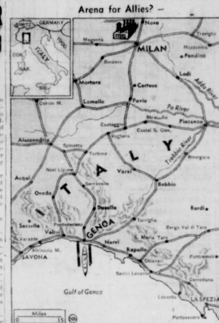
Here is the area stretching up from the Italian ports of Genoa and La Spezia to the industrial city of Milan—an area which will be bitterly contested by the Nazis if Allied invasion forces strike.

WEST TEXAS—Little change in temperature, scattered showers in west and extreme south portions this afternoon, tonight and Friday forenoon.