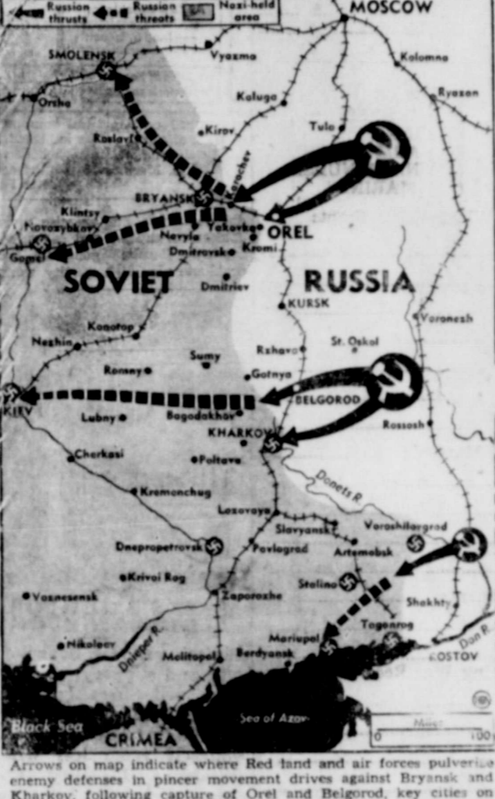
Arrows on map indicate where Red land and air forces pulverize enemy defenses in pincer movement drives against Bryansk and Khar'kov, following capture of Orel and Belgorod, key cities on central Russo-German front.