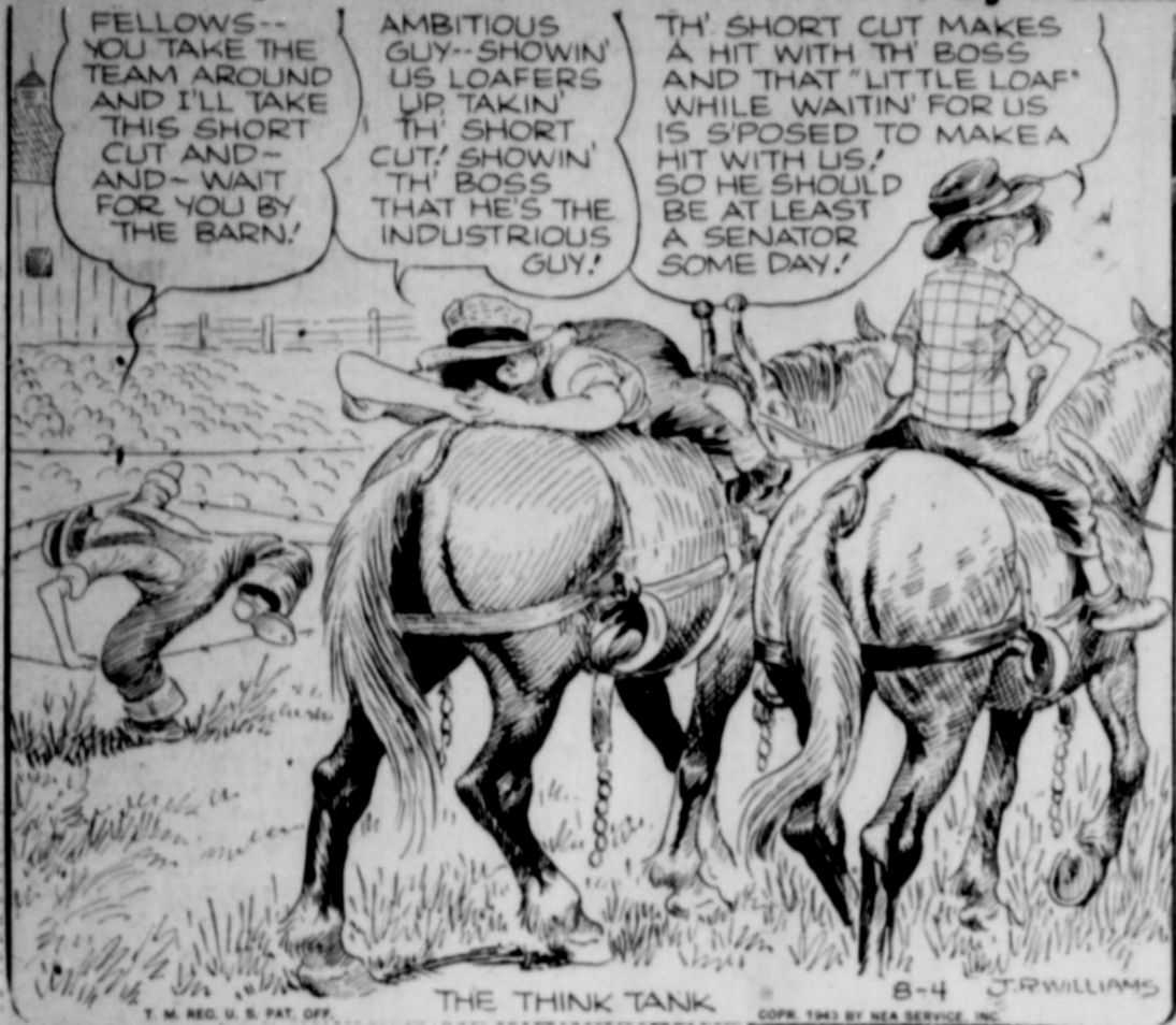
THE THINK TANK

Karnes counties. Though the recent Gulf hurricane was reported to have done some damage to the 1943 rice crop, several south east Texas counties report urgent needs for workers as soon as weather conditions permit harvest. Among these are Chambers, Colorado, Fort Bend, Galveston, Jefferson, Waller, Brazoria, and Liberty.