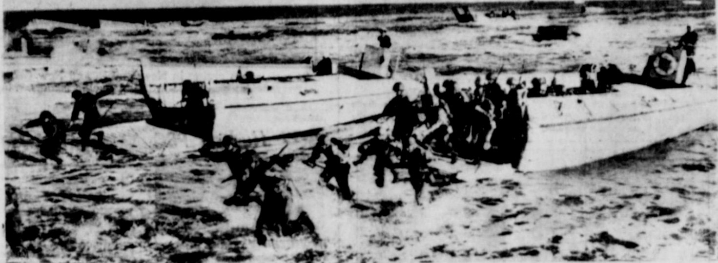
LANDING BARGES such as these carried American, British Canadian soldiers to the shores of Sicily. After beachheads were established, more troops and tanks followed in larger barges to carry the offensive inland against axis forces.