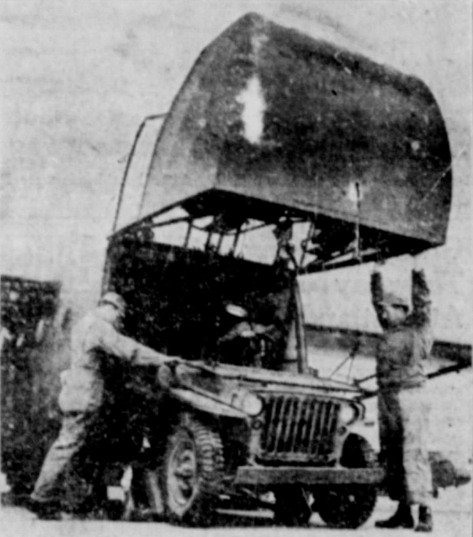
FLYING FREIGHT CAR—In carrying a jeep on a glider, the entire pilot's compartment lifts on hinges. The same procedure is followed in loading artillery.