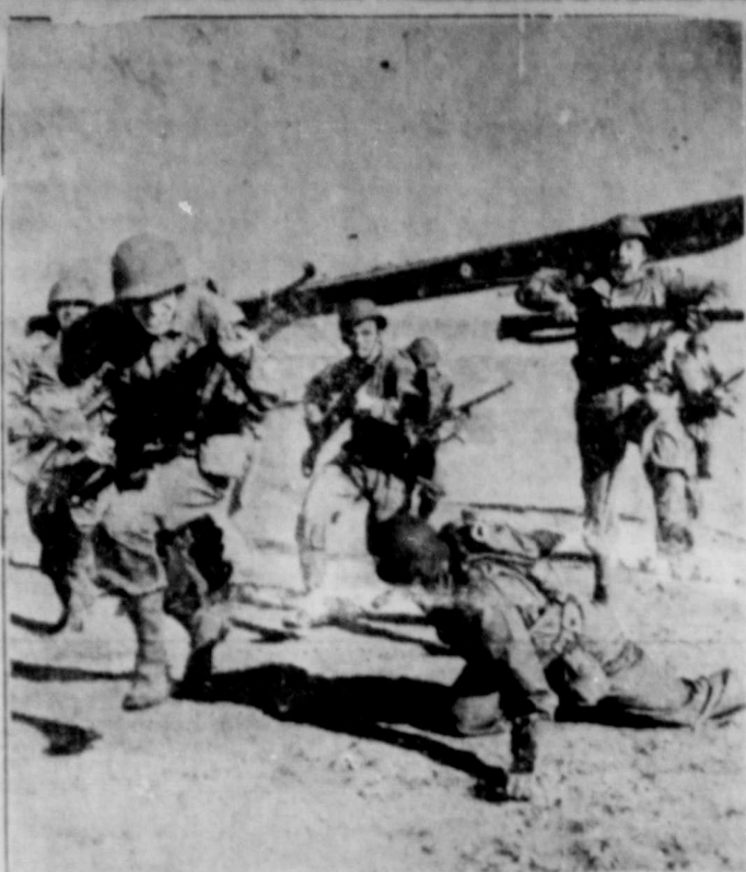
PEPPED FOR INVASION—As soon as the landing is made men pour from the gliders, and under smoke screen protection, prepare to knock out enemy positions.