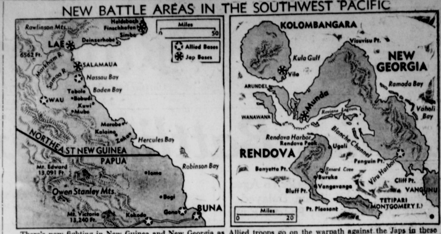
There's new fighting in New Guinea and New Georgia as Allied troops go on the warpath against the Japs in these jungled Southwest Pacific islands. Maps show closeup views of the two arenas of attack.