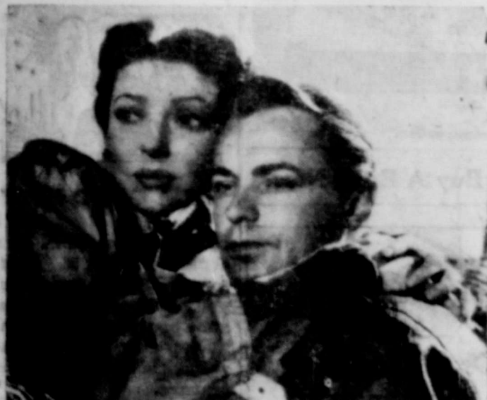
Loreta Young and Alan Ladd, co-stars of Paramount's gripping drama "China," story of the invasion of that country by the Japanese.