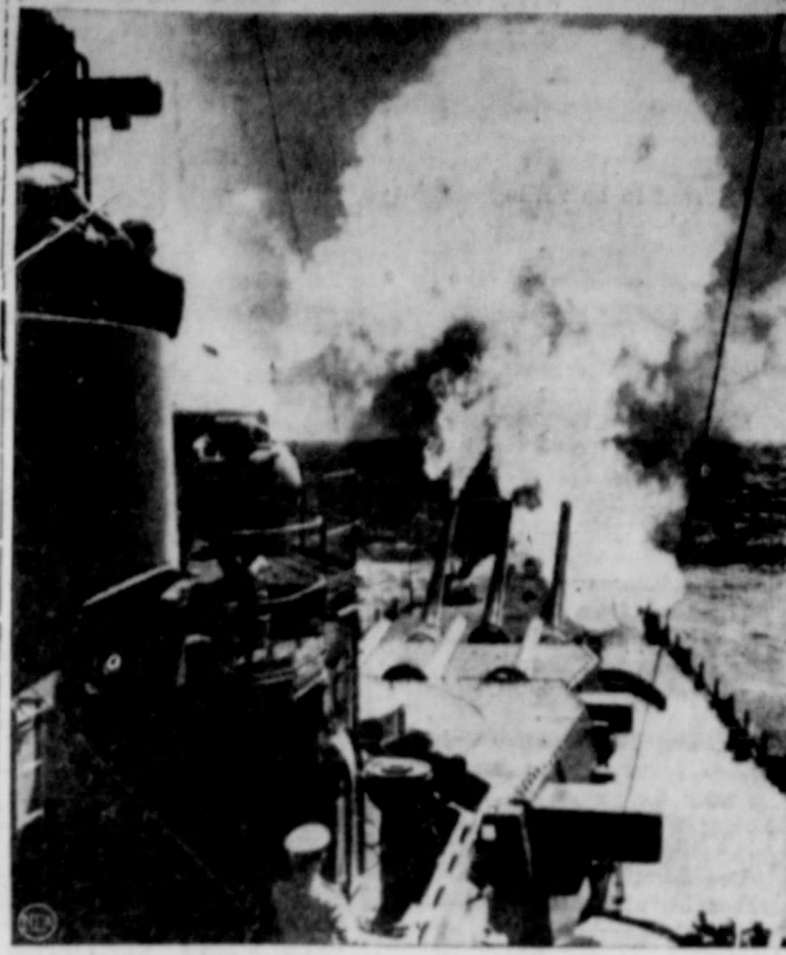
Blasts in the night from the guns of Allied warships set off the invasion of Sicily. Tremendous salvos, such as the fire from a U. S. battleship's 16-inch guns, above, started a chain of smoke and flames 10 miles inland on the Sicilian coast, according to eyewitness report.

One bottle won does not win a war. We've got tougher times ahead. Buy More War Bonds For Freedom's Side