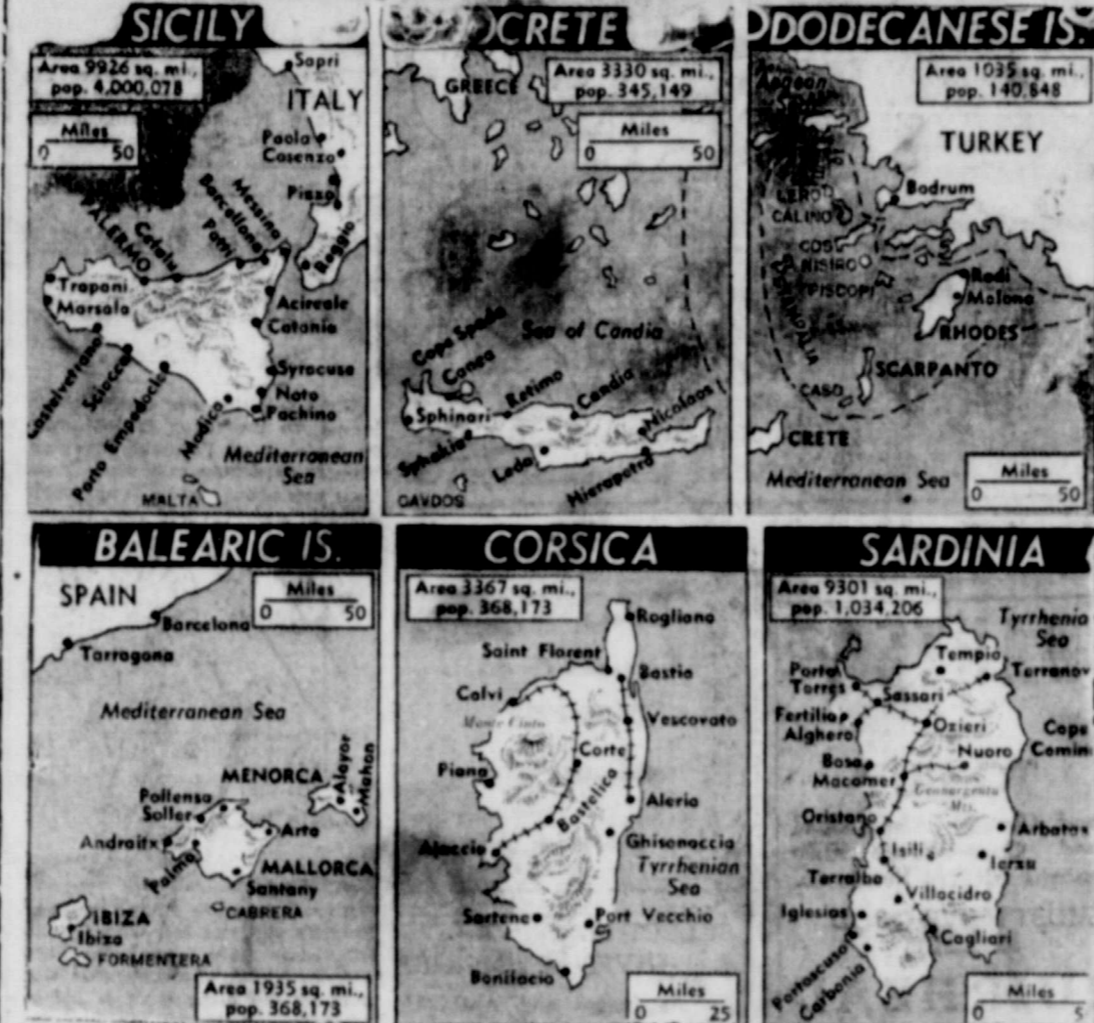
Potential stepping stones for the allied invasion of Europe are these six islands and island groups in the Mediterranean. Five are axis-held and likely targets for attack, while Spain owns the Balearic Islands on the sea route to southern France.