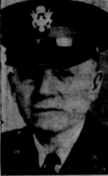
Maj.-Gen. Oscar W. Griswold, former 4th Army Corps commander, has succeeded Maj.-Gen. Alexander Patch as commander on Guadalcanal.