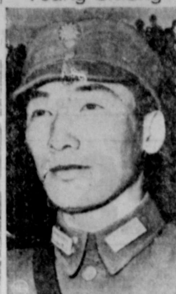
Fighting for China like his famed father is artillery Capt. Chiang Wei-kuo, youngest son of the generalissimo.