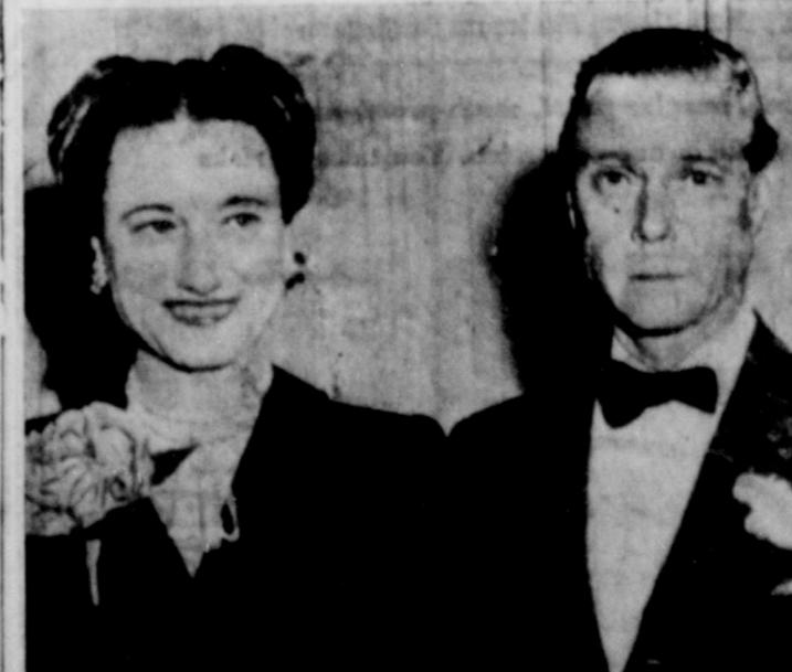
Visitors in New York again are the ever-attractive Duchess of Windsor and the Duke, whose face begins to betray his years.