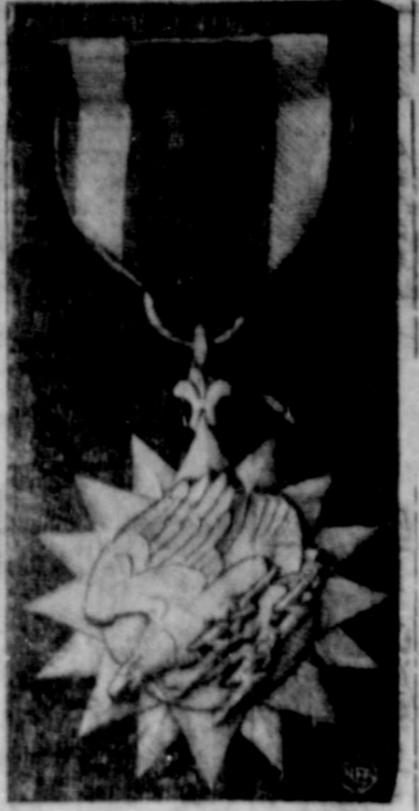
Air hero whose meritorious acts do not warrant a Distinguished Flying Cross will receive this compass rose pendant surmounted with fleur-de-lis, eagle and lightning bolts. Ribbon is blue and gold.