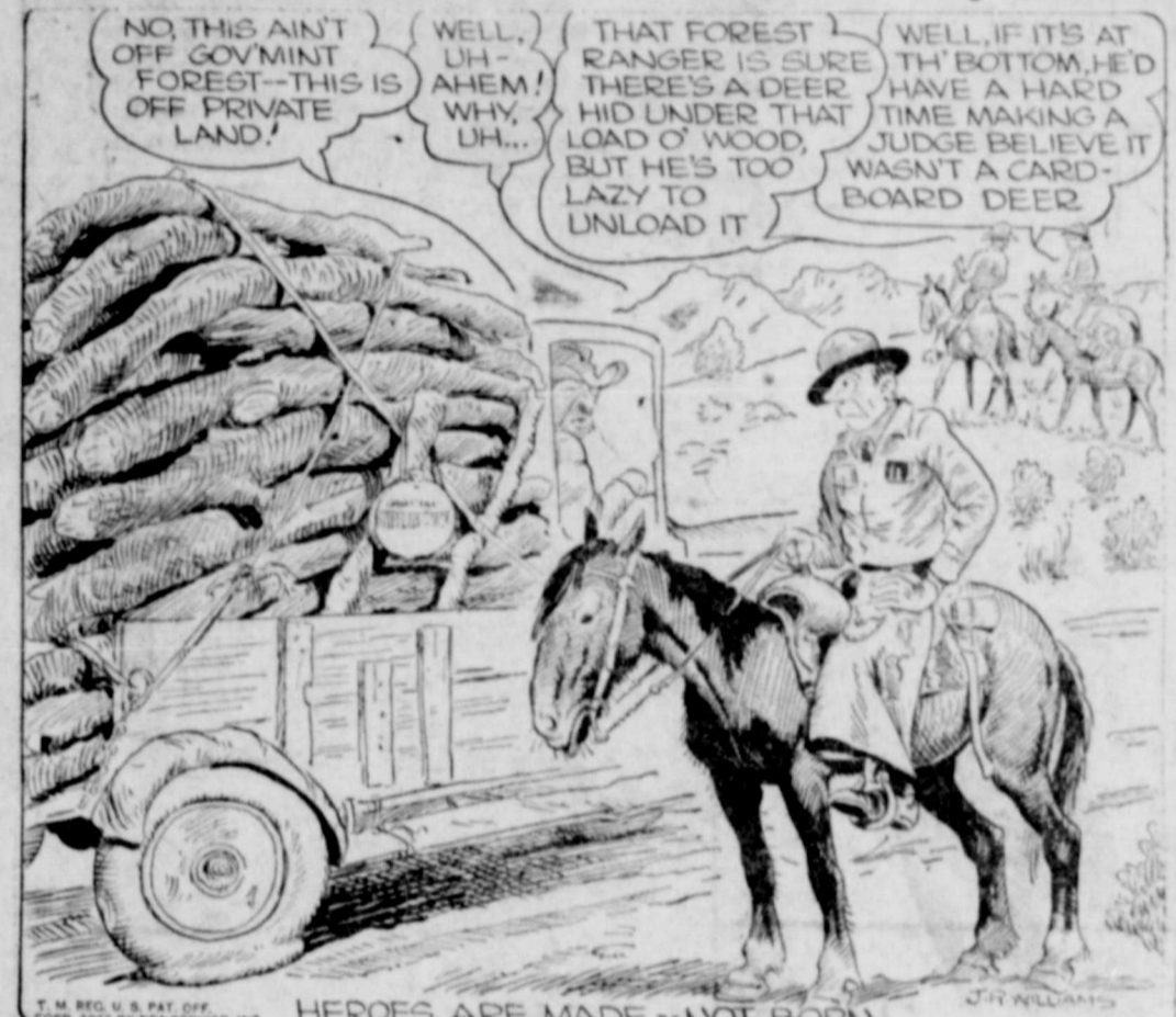
HEROES ARE MADE -- NOT BORN