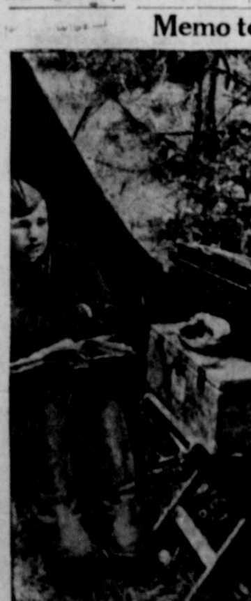
Russian battlefield stenographer keeps tommy gun handy for use on enemies, not because officer-boss might get fresh.

At Darwin, he was assigned to piloting a command plane but volunteered for additional service with a fighter group.