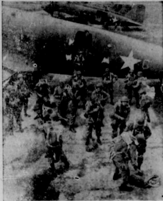
The line of planes with the white star painted on their sides are U. S. Douglas troop carrying planes. American paratroops are shown in front of one of the planes helping each other to "harness up" during a recent exercise. When you put 10% of your income into War Bonds each payday, you help pay for the equipment these boys need to bring Victory.