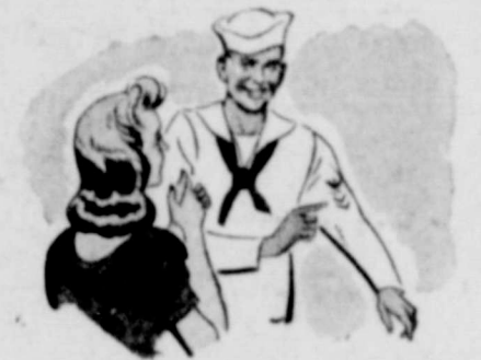
Another promotion—and extra pay!

This new book lists the pay for every job. Tells how you win your first promotion—and increase in pay—after about 2 months on completion of recruit training. How you can get extra pay for special duties—up to 50% above regular base pay. And all about the liberal allowances for men with dependents.