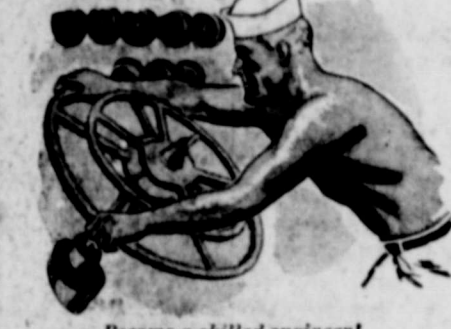
Become a skilled engineer!

First, read every word of this message. Then write, phone or call today at the