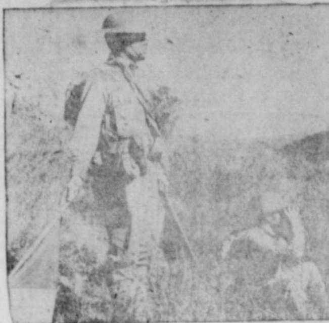
Signalling by semaphore often plays a big part in Marine Corps activities. Here a Marine Corps private sends a message to a nearby outpost while the observer, a Leatherneck corporal, reads the return message.