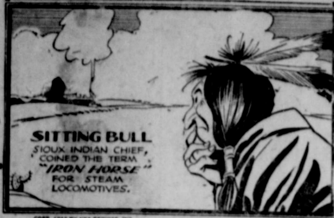
SITTING BULL, Sioux Indian chief, coined the term "Iron Horse" for steam locomotives.

MOST TREE-NESTING BIRDS THAT RAISE TWO BROODS IN A SEASON BUILD A NEW NEST FOR THE SECOND BROOD.