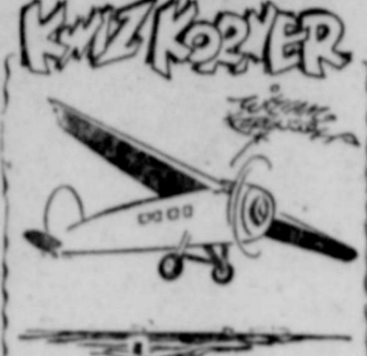
WHAT NAMES DO YOU ASSOCIATE WITH THE FOLLOWING AIRPLANES—SPIRIT OF ST. LOUIS, HINWISS MAIL, SOUTHERN CROSS, FLYING LABORATORIES?

MOST TREE-NESTING BIRDS THAT RAISE TWO BROODS IN A SEASON BUILD A NEW NEST FOR THE SECOND BROOD.