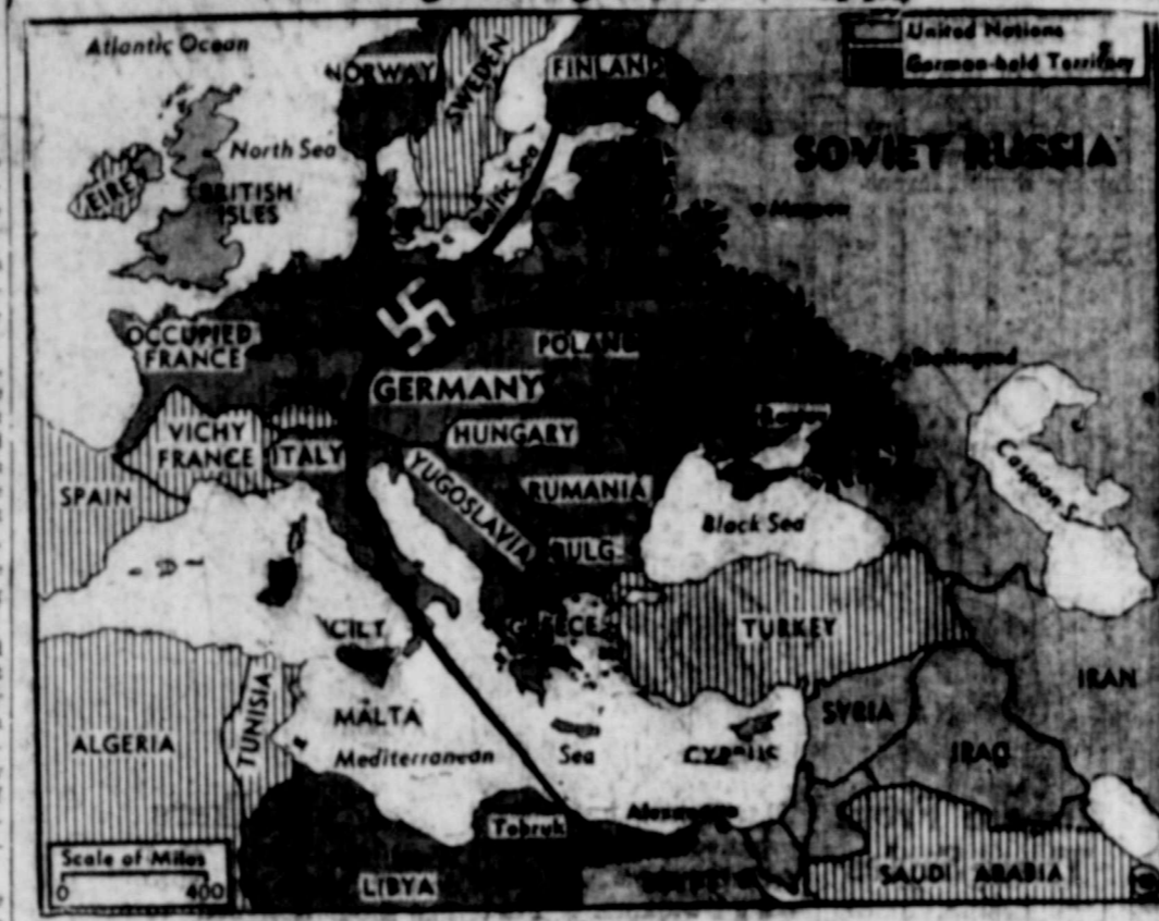
New problems are one price of victory. Three years of war, which have seen many Nazi successes, also have seen Germany's problems of communications and supplies greatly increased. Map shows routes over which men, materials and food must be transported to various German forces.