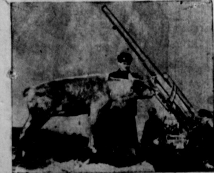
Russian anti-aircraft gun crew on Northern Front takes time to play with Leshka, their reindeer mascot. (Passed by censor.)