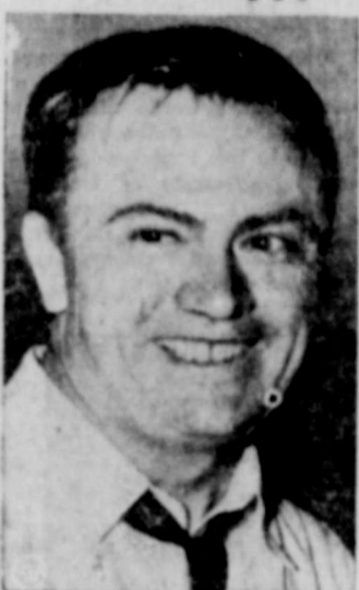
W. Lee O'Daniel