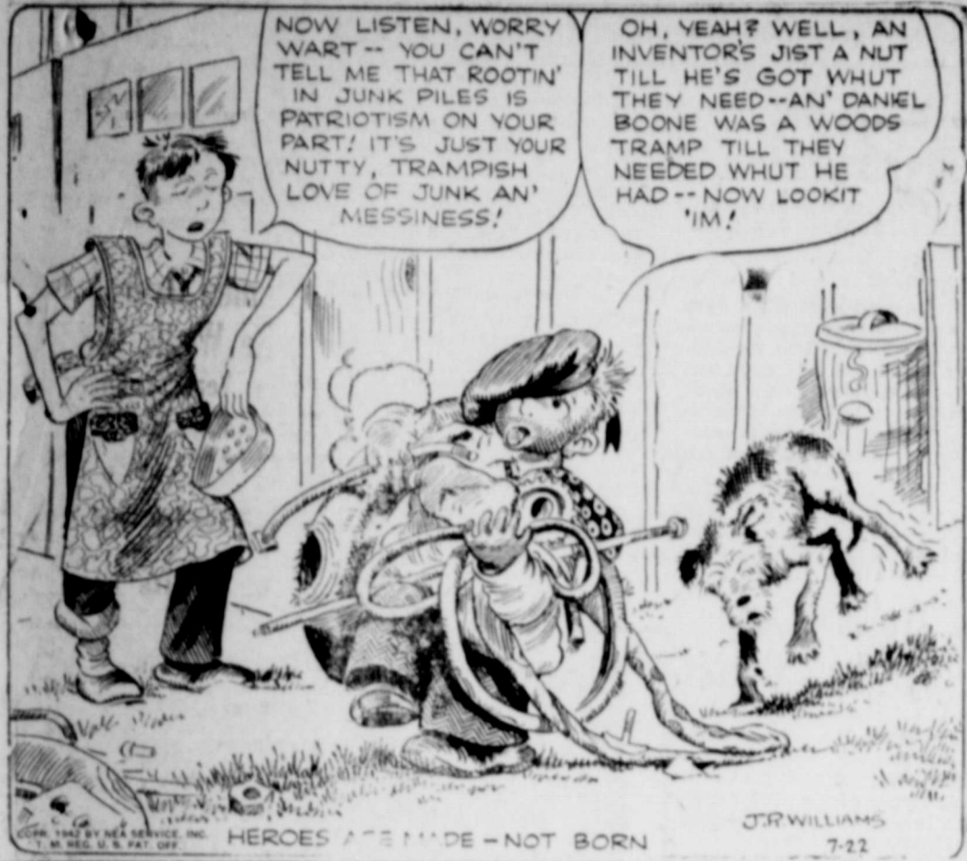
HEROES ARE MADE--NOT BORN