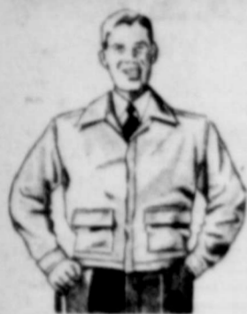
Sub 167 Tab 167 Scrub 167

For HOME and CAR For SPORTS and RECREATION