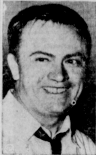
W. Lee O'Daniel