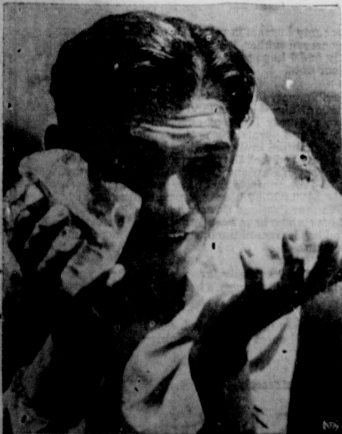
A chunk per cheek keeps Ben Hogan cool after firing blistering 67 for Ryder Cup team in matches with Walter Hagen's challengers at Oakland Hills Country Club in Detroit.