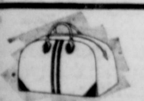
Gray Cover ZIPPER BAG