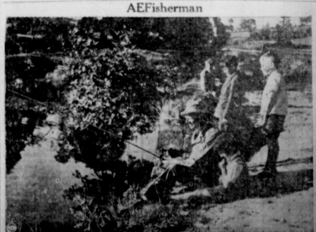
U. S. soldier gathers audience as he fishes in Northern Ireland stream.