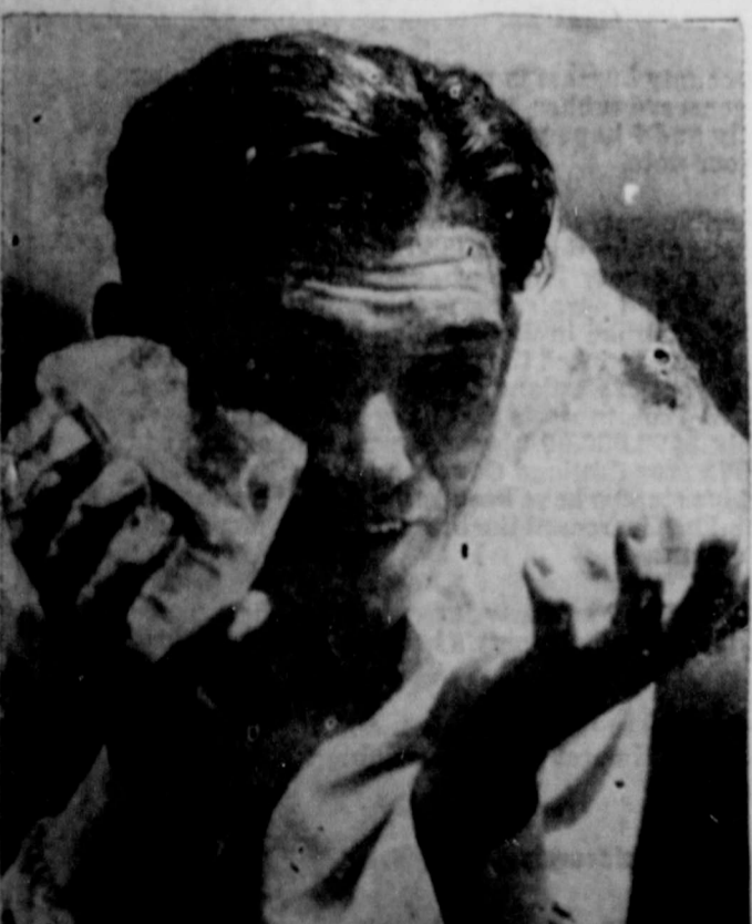
A chunk per cheek keeps Ben Hogan cool after firing blistering 67 for Ryder Cup team in matches with Walter Hagen's challengers at Oakland Hills Country Club in Detroit.