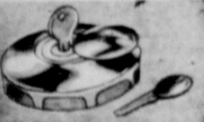
Stop Gasoline Thieves With This Gas Tank Locking Cap

Casual-type Excellent tailored Large roomy pockets For smart appearance, buy this jacket, fully lined with rayon cloth. Choice of rich cocoa brown or beige.