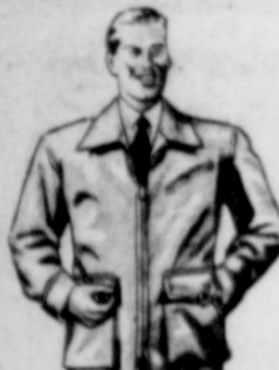
An All-Round Out-of-Doors Coat

Stays fresh and crisp through countless dry cleanings or launderings—because it is 'Zelex' finished. It resists wind, rain and non-oily staining liquids. Folds into small bundle. An excellent wind-breaker.