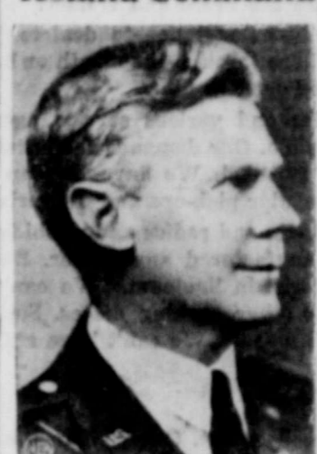
Maj. Gen. Charles H. Bonesteel, chief of American troops in Iceland, is the new commander of all United Nations forces on that island.