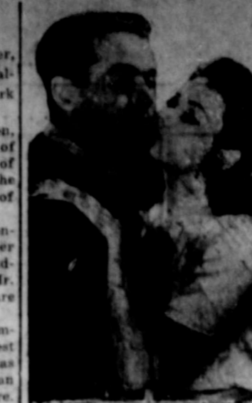
Gene Tierney and Henry Fonda in a shot from "Rings On Her Fingers" which will be shown at the Arcadia theatre beginning today.

The regular weekly singing will be held at the Second Baptist Church this evening at 8 o'clock, it was announced today. All singers and lovers of good singing have been invited to attend.