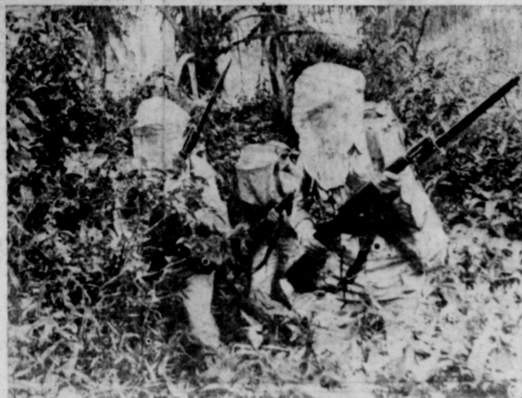
It's war against jungle and insects in Dutch Guiana for these United States troops protected by heavy mosquito nets.