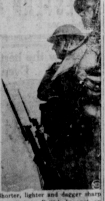
Shorter, lighter and dagger sharp is new type British bayonet on rifle of soldier at right, although old style weapon alongside looks quite effective.