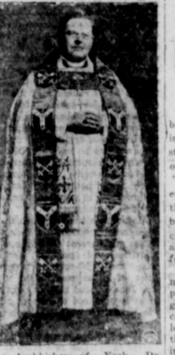
The Archbishop of York, Dr. William Temple, 61, above, is considered a likely successor to the retiring Archbishop of Canterbury, the Most Rev. Cosmo Gordon Lang, 77, as head of the Church of England.