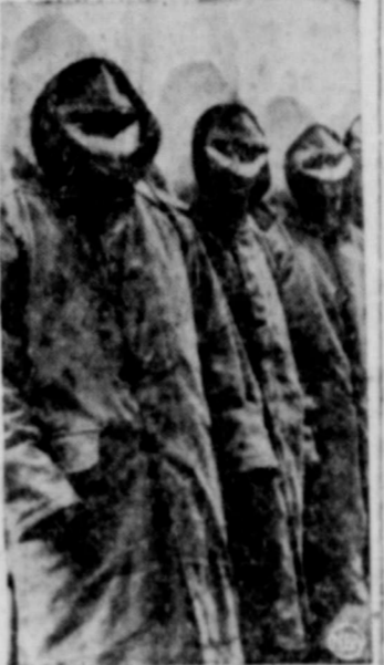
Arctic visors protect faces of British seamen from icy blasts encountered as they speed aid to northern Russian ports.