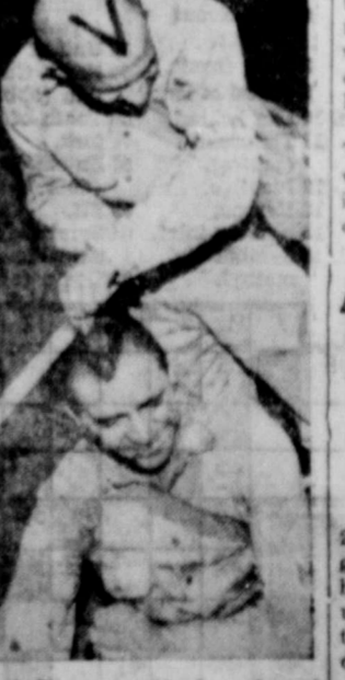
Painted V's top off close-shaved haircuts of these recruits in Hawaii Territorial Guard at Honolulu. Head shaving wasn't done with that bayonet.

WASHINGTON.—After conferring with President Roosevelt at the White House today, Basil O'Connor, President of the National Foundation for Infantile Paralysis, announced a radical departure in the use by Chapters of the National Foundation of the 30 per cent received by them this year from the President's Birthday Celebration.