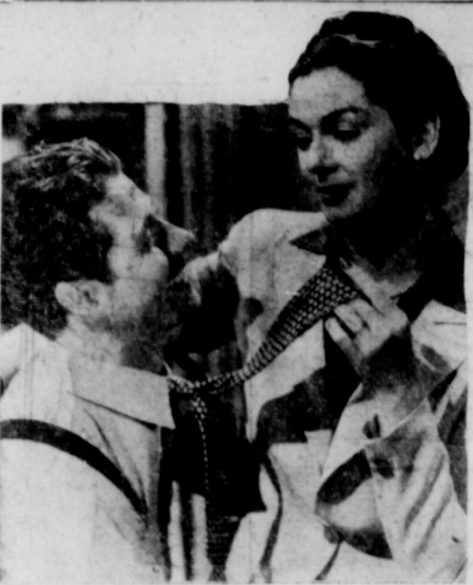
Fun loving Bohemians are Don Amoch and Rosalind Russell as they appear in the romantic laugh-bit, "The Feminine Touch," which comes to the Arcadia theatre for two days beginning Wednesday, Kay Francis, Van Heflin and Donald Meek are others in the delightful cast.

SCHOOL DRESSES ARE THE SCHOOL GIRL'S FRIEND, GINGHAMS AND CHAMBRAYS $3.95 SEE OUR HIGH SCHOOL WINDOW 219 Main St. - Phone 275