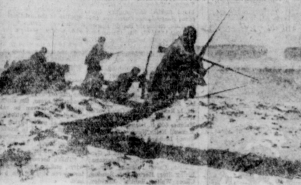
Ghost-like soldiers of the Red army leave their trenches and move into the face of a blizzard as they attack frost-bitten Germans in the Tula sector before Moscow.