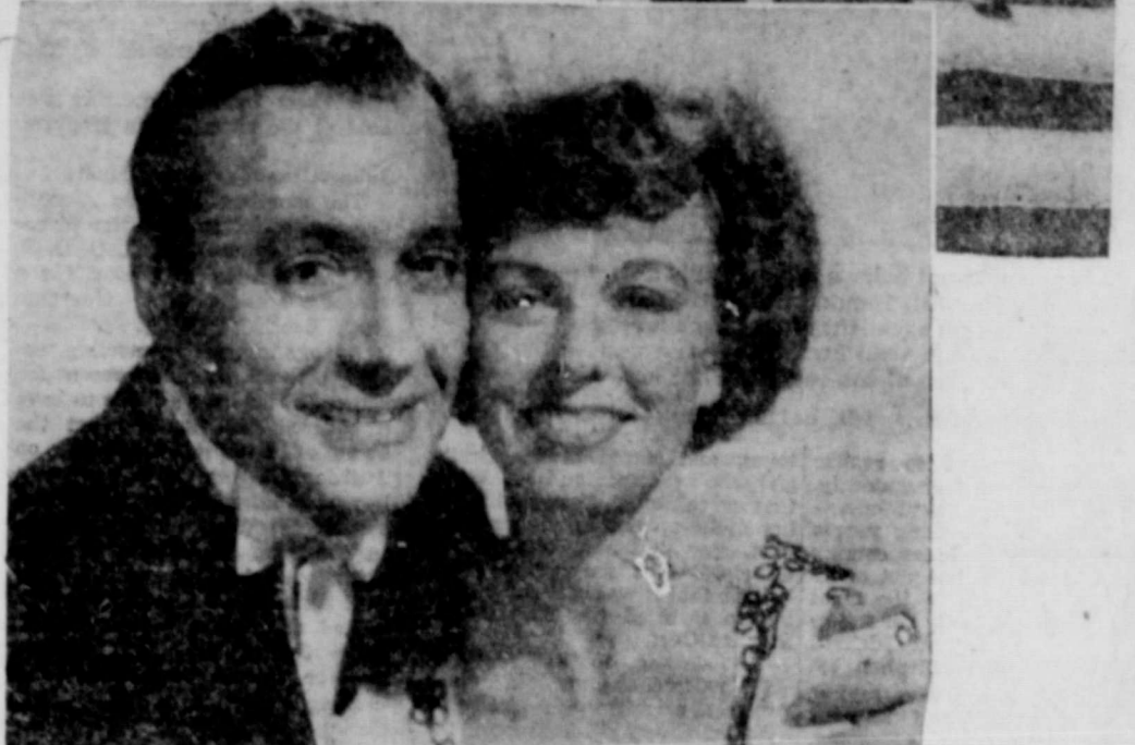
A gay, streamlined comedy-romance, "Appointment For Love," comes to the Arcadia theatre today with Charles Boyer and Margaret Sullavan as the brilliant co-stars.