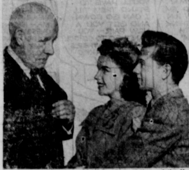
Lewis Stone, Judy Garland and Mickey Rooney, three of the Hardy family cast are shown in a scene from "Life Begins for Andy Hardy," their latest screen hit now playing at the Arcadia Theatre.