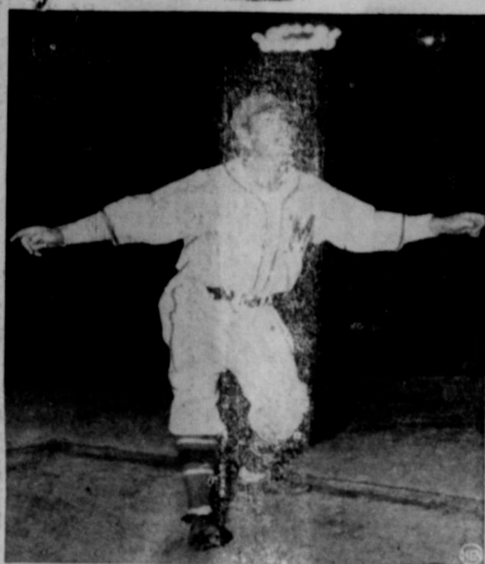
Charley Grimm doesn't profess to rate halo formed by cluster of lights at Milwaukee park, but former Cub manager will be luminous figure if he succeeds in getting Brewers out of American Association cellar. Grimm established reputation as comic in Chicago coach's box. Entertainment comes in handy. It helps fans forget club.

By United Press SAN ANTONIO, Tex., July 31.—Mounting lions, weasels, coyotes and bobcats are dying out because of the work of the Predatory Animals and Rodent Control Association. Association agents claimed today they have killed 15,000 of the state's larger undesirable animals by trapping, shooting, poisoning and other methods. The casualty list include 12,912 coyotes, most numerous of the predators; 2,068 bobcats; 839 wolves, and 24 mountain lions. Rodents were exterminated "by the thousands," the Association announced, and prairie dog towns and gopher-infested areas are being cleaned out or controlled. Best hunting for the bigger game was in Hudspeth county where 1,123 predatory animals were taken. Zavala county was second with 1,049 captured or killed. The greatest number of bobcats—41 per cent were taken in four western counties. Culberson, Hudspeth, Presidio and Jeff Davis. Texas farmers, ranchers and business men are able to operate more economically and with less danger from disease because of the predatory and rodent control program, Association officials said.