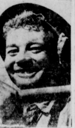
Just before the battle an Australian "digger" wore this smile, anticipating the British victory in Syria.