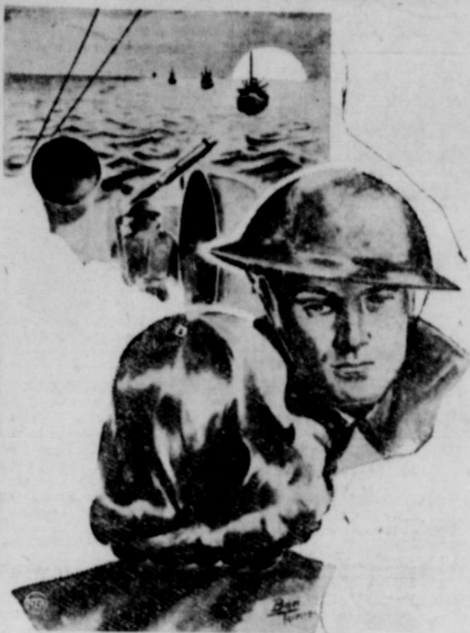
A Boy and a Girl Find There's Time for Love Even Though Danger Lurks Behind Every Wave

REGRET to state, Gentlemen," said the commodore leading at Troopship Convoy Conference, "that the British intelligence has obtained positive information that a Nazi agent will among the 20,000 troops sail with us tomorrow . . ." From the expanse of mahogany-paneled Sea Dogs' bronzed failed to register any emotion. Only by their neglected cigar and strained postures could detect the appressed excitement among the gathering of Canadian and British naval officers. "This Nazi agent," the commodore continued in a monotone, "is reported to be a member of one of the units. It is obviously impractical at this date to start an investigation of 20,000 soldiers so he'll have to come along. His mission is possibly designed as a suicide chore and likely to get information in enemy fashion that might bring about an attack on the convoy." "I have a surprise for you," he is lying in the basin a large merchant ship convoy waiting to start. It will start at dawn. The troopships will leave on a separate schedule later in the day and the merchant men at a rendezvous as provided in your orders and then take up position L . . ." There was a murmur of protest. The Sea Dogs knew the perils of an unprecedented move—fast in greyhounds and ponderous in heavy sea. The commodore's kettle boil before resuming his unprecedented and the realizes the task lying