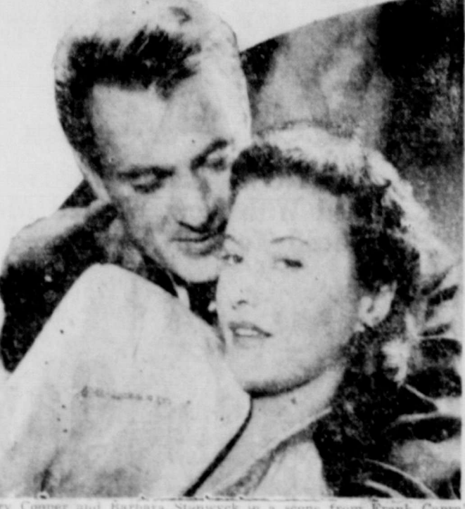
Gary Cooper and Barbara Stanwyck in a scene from Frank Capra's hilarity "Meet John Doe" which will be seen here at the Arcadia theatre beginning today. Edward Arnold and Walter Brennan are also featured.