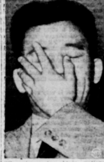
"Conspiracy to obtain national defense information to be used for the injury of the United States and to the advantage of a foreign power." That's the charge against Ibaru Tatibana, lieutenant commander in the Imperial Japanese Navy, shown ducking at his arraignment in Los Angeles.