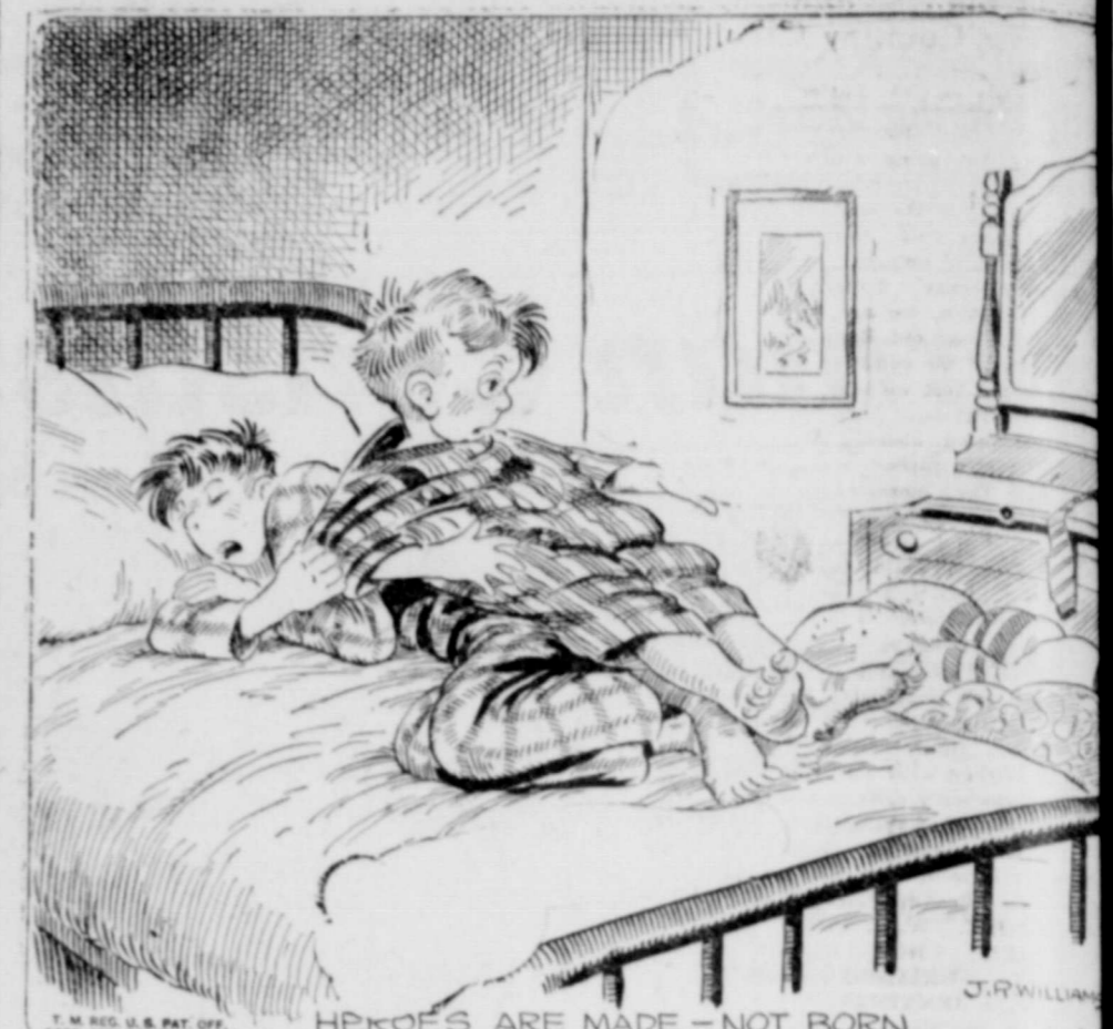
HEKOE'S ARE MADE - NOT BORN