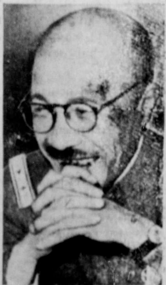
Whole world is about to plunge into war, warns Hideki Tojo, above, Japanese minister of war, as tension between his country and Dutch East Indies reaches new pitch.