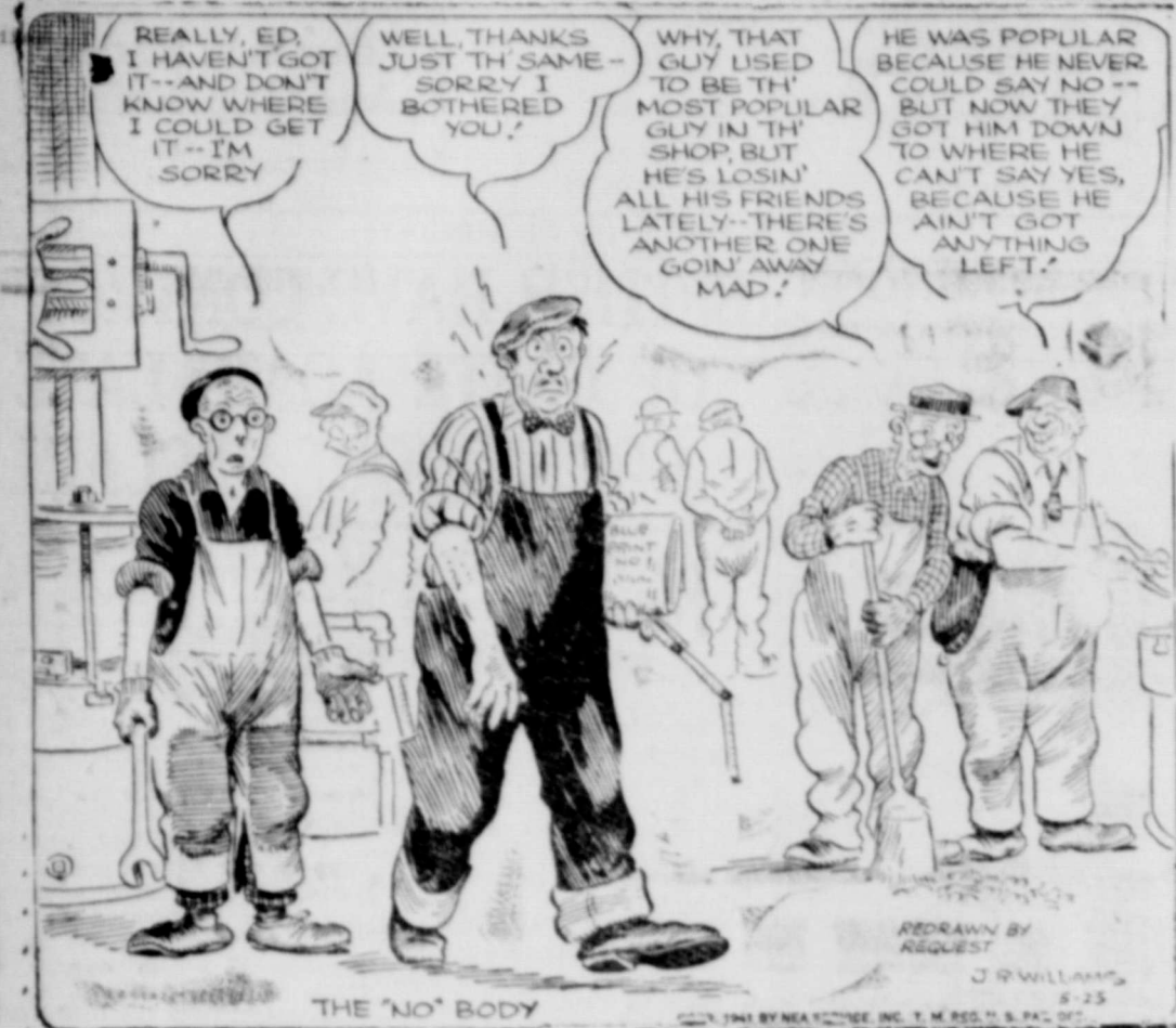
THE 'NO' BODY