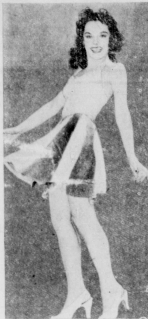
This certainly is eye-filling and heart-warming during such troublous times. Janet Waldo, radio starlet, models a summery play dress out Los Angeles way.