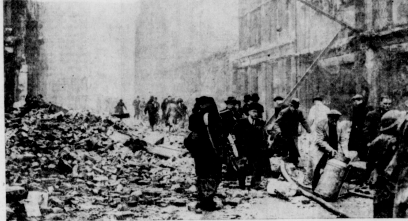
This picture of bomb destruction in London isn't as spectacular as so many, yet it will come straight home to every man and woman who hears an alarm clock in the morning, gets up and goes to work. It shows working people of London—ranging from stenographers and day laborers to highly-paid executives—making their way along a down town street after one of the great city's heaviest raids. Terror of bombings and weariness of sleepless nights shows plainly on the faces of these people. But, war or no war, they must get up in the morning and go to work. Just like you and I.