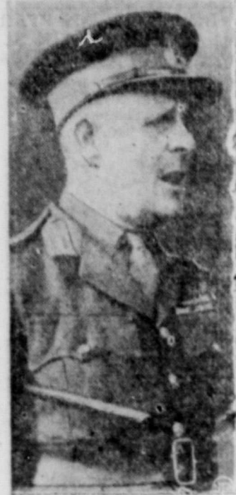
Chosen by Britain to command defense of threatened Gibraltar is General Viscount Gort, above, hero of the Dunkirk evacuation.