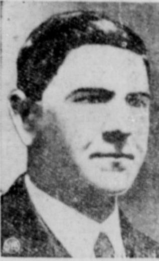
Ante Pavelic, above, Croat National Movement chief, reportedly wired Mussolini that his group favors Italians against Yugoslav homeland.