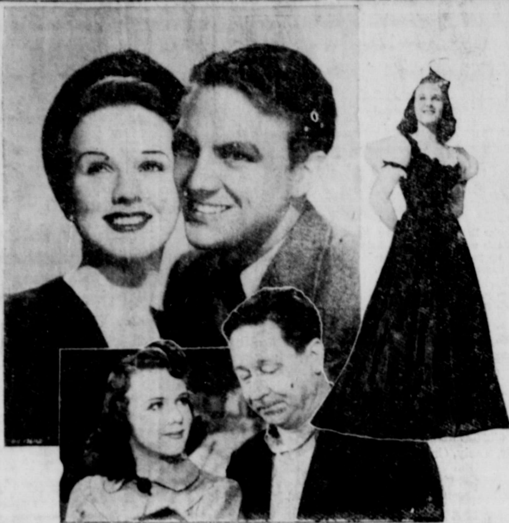
In the Arcadia theatre's presentation of "Nice Girl" to row days beginning today, the screen will reveal a new, charmingly "misbehaving" Deanna Durbin in what critics are hailing as her most sparkling role. To the millions who loved her as the impish little "smart girl" will undoubtedly be added millions more who will adore her as one of the screen's most talented actresses. In the picture Miss Durbin is surrounded by a supporting cast that includes such luminaries as Robert Stack, Robert Benchley, Franchot Tone, Walter Brennan and Helen Broderick.