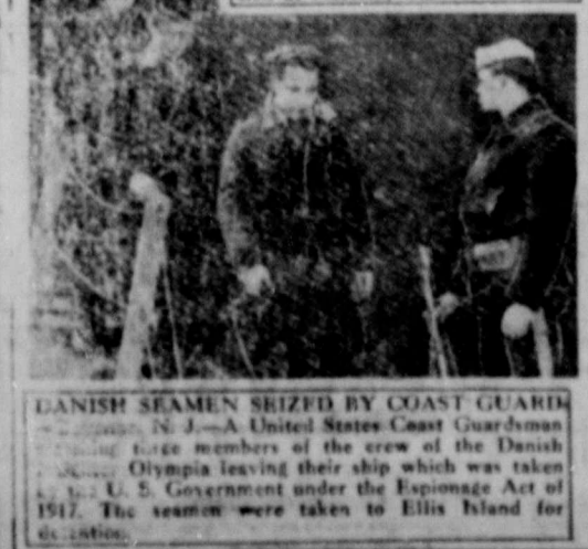
DANISH SEAMEN SEIZED BY COAST GUARD—San Juan, P. R.—A United States Coast Guard cutter today seized three members of the crew of the Danish ship Olympia leaving their ship which was taken to the U. S. Government under the Espionage Act of 1917. The seamen were taken to Ellis Island for detention.