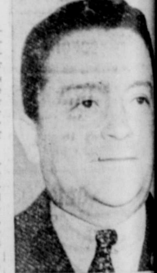
Arthur Bliss Lane, American minister to Belgrade, stays with Yugoslav government as national leaders seek safety mountains.