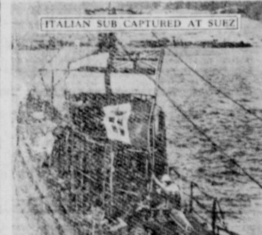
ITALIAN SUB CAPTURED AT SUZ—Suez Canal—A British sailor raises the British flag above the Italian flag on a captured Italian submarine at the southern entrance to the Suez Canal, where the sub was captured when she attempted to attack a convoy recently.