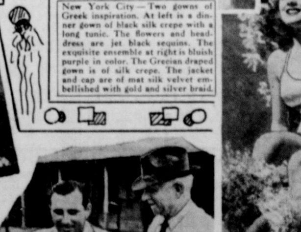
New York City—Two gowns of Greek inspiration. At left is a dinner gown of black silk crepe with a long tunic. The flowers and head-dress are jet black sequins. The exquisite ensemble at right is bluish purple in color. The Grecian draped gown is of silk crepe. The jacket and cap are of mat silk velvet embellished with gold and silver braid.