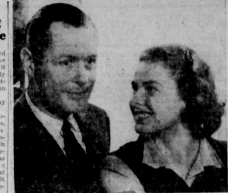
Pictured above are Robert Montgomery and Ingrid Bergman capable co-stars of MGM's dramatic hit "Rage in Heaven." Directed by W. S. Van Dyke the picture opens a two-day engagement at the Arcadia theatre Wednesday. The superb supporting cast includes George Sanders, Lucille Watson and Oscar Homolka.

The Home of your Dreams Can Now Be Yours! • No Down Payment • Low Rate Interest Burton-Lingo Co Try Our Want Ads!