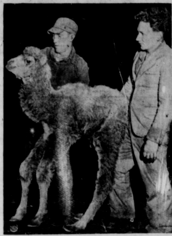
Spring, circus and baby camel all arrive in New York about the same time. Ringling Brothers-Barnum and Bailey roustabouts help four-day-old infant from train on which it was born en route from winter quarters.