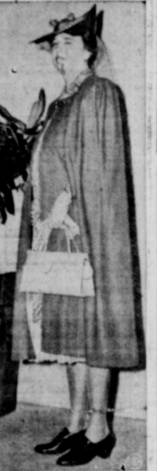
Mrs. Franklin D. Roosevelt went shopping on Fifth avenue, New York, for her Easter wear this year and selected this new "drooped shoulder" cape ensemble for afternoon. It is of aqua wool, with pleated skirt and aqua lanku straw hat.