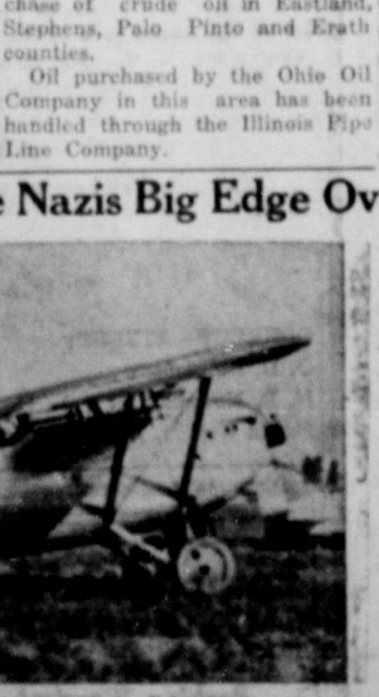
With war between Germany and Yugoslavia underway, the Germans have one great advantage: they have 2000 first-line planes like those at right above concentrated along the Yugoslav borders