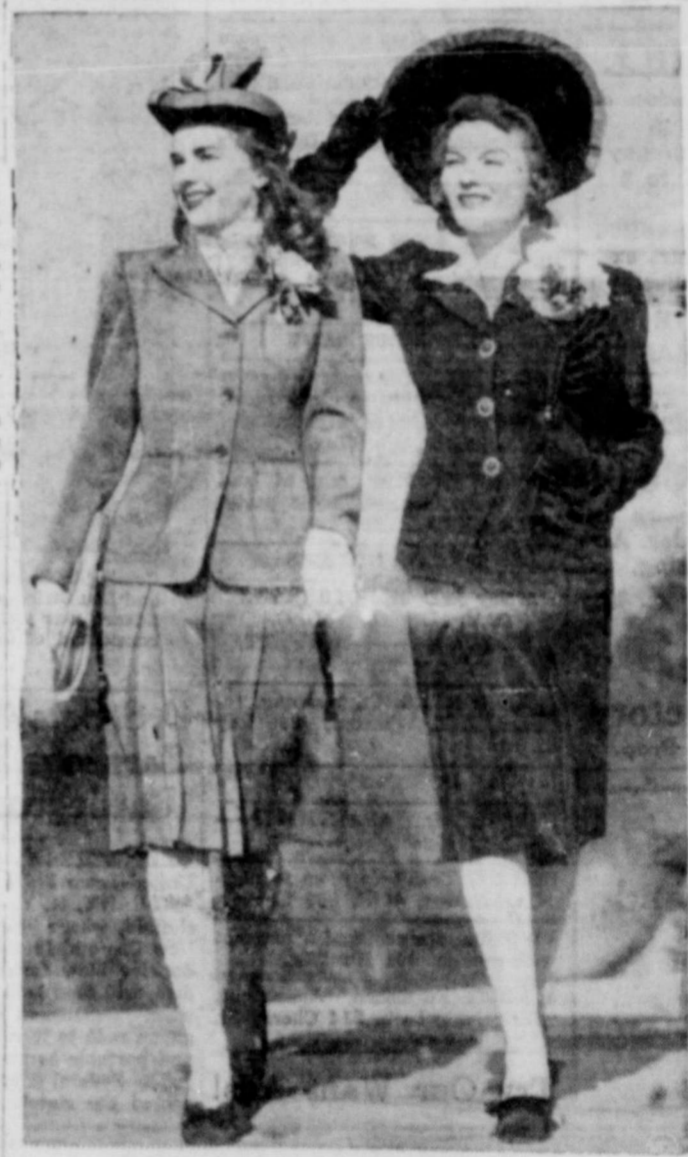
(Suits from Russels, New York) Styled to suit the woman of good taste but guaranteed not to wreck even extremely low budgets are these two perfect Easter outfits. The dressy suit at right is of black rayon faille with jeweled buttons and a silk pique collar that creates a modified "plunging neckline" effect. The possum blue gabardine model, left, is simply tailored with three pockets and a pleated skirt.