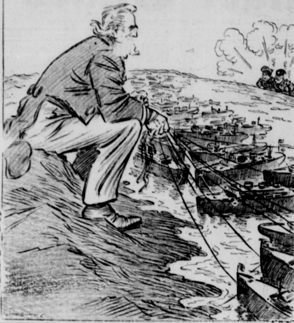
There's an Easier Way