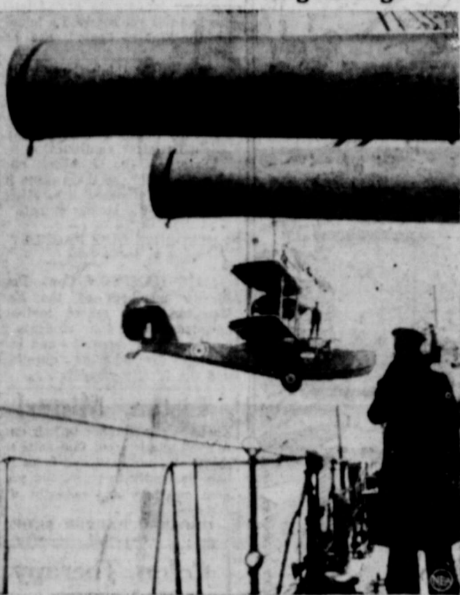
Another sample of British sea might is this picture of a Walrus amphibian plane being hoisted aboard new H. M. S. King George V, potent fleet unit, after returning from patrol.