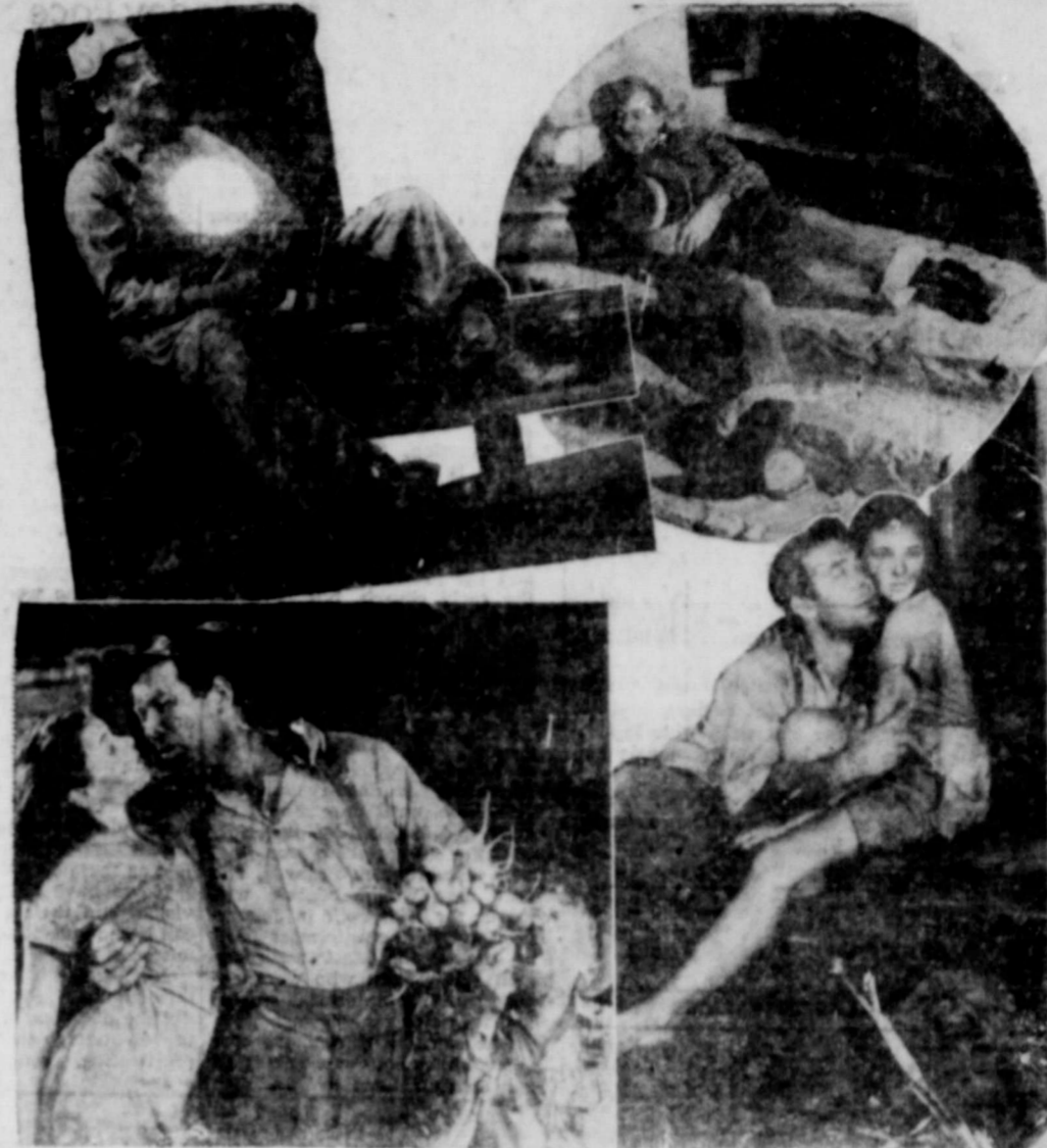
Slumber and romance along Tobacco Road pictured above in scenes from Twentieth-Century Fox new picture "Toobacco Road." Atop Charley Grapewin as Jester Lester and Slim Summerville as Peabody take an afternoon rest. Below Ward Bond as Lou and Gene Tierney as Ellie May woo with a bunch of turnips tossed in. The picturization of the famed stage show is rated as among the year's finest and will be seen at the Arcadia theatre beginning today.