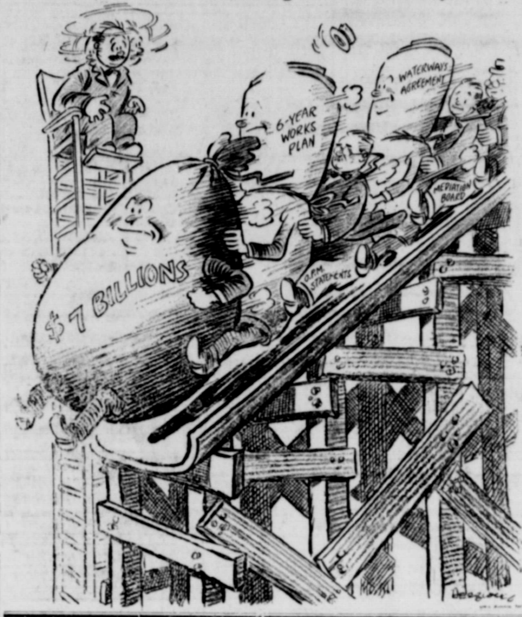
Hold That Pose!