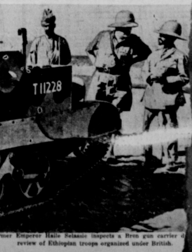
Former Emperor Haile Selassie inspects a Bren gun carrier during review of Ethiopian troops organized under British.