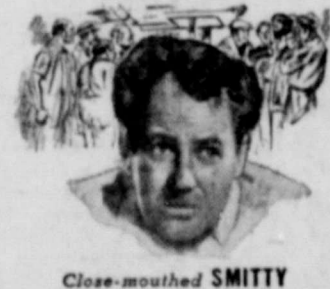
Close-mouthed SMITTY (Ian Hunter)... who kept his trouble to himself.