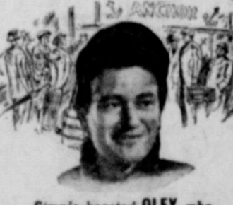
Simple-hearted OLEY , who was going home at last. (John Wayne's finest role).

Walter Wanger presents JOHN FORD'S Production of EUGENE O'NEILL'S The LONG VOYAGE HOME