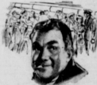
Quick-witted DRISCOLL , brilliantly played by Thomas Mitchell, Academy Award winner.

America's greatest playwright sets forth the savage emotions of sailormen and waterfront women... in a drama tumultuous as the rolling sea itself! Played by a brilliant cast... filmed by the gifted director of "Stagecoach" and "The Grapes of Wrath".