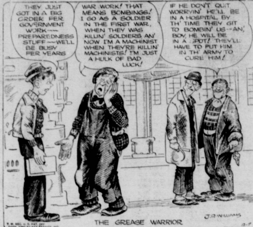
THE GREASE WARRIOR