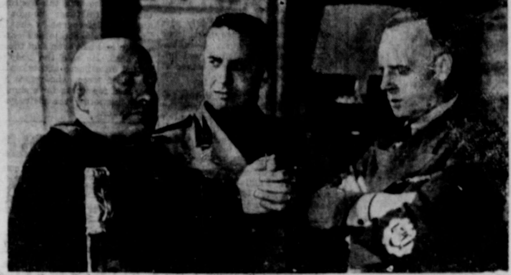
Apparently pondering next move in axis military-diplomatic maneuvers, three key men in Adolf Hitler's "new order" for Europe seem lost in thought. Pictured during recent conference at Florence, Italy, are Premier Benito Mussolini, Italian Foreign Minister Count Galeazzo Ciano and German Foreign Minister Joachim von Ribbentrop.