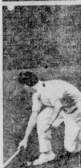
Bobby Riggs, foreground, defeats Don McNeil in Los Angeles for Pacific Southwest men's singles championship. 5-7, 2-6, 6-0, 12-10, 6-3. Riggs wins in same manner as McNeil beat him at Forest Hills for national title taken last three sets.