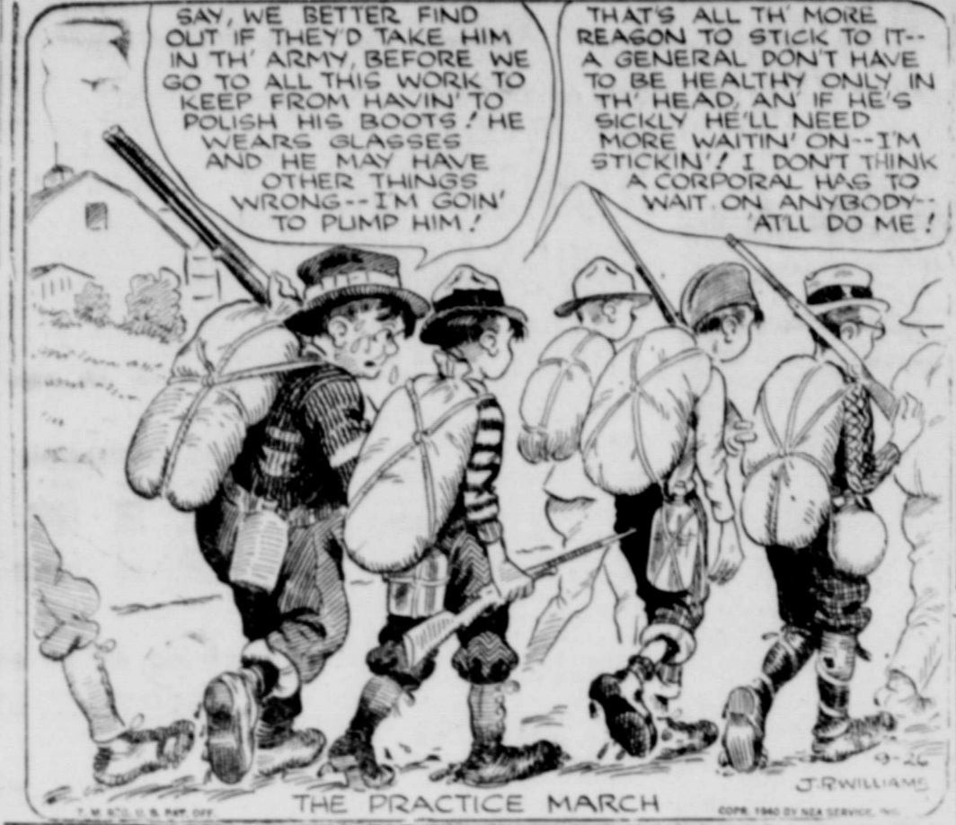
THE PRACTICE MARCH