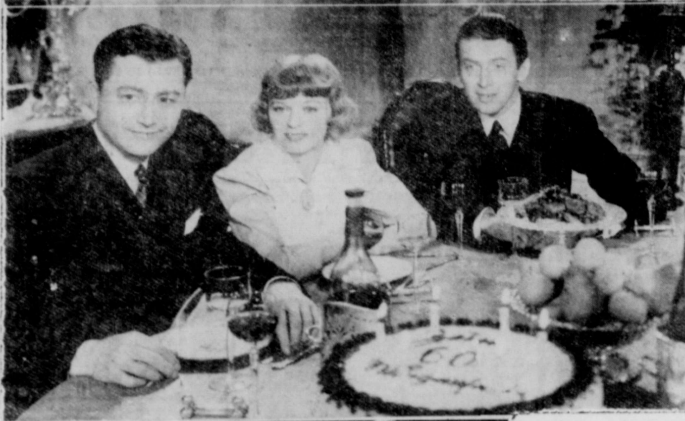
"Before the swastika flew over the country the pictured group above was a happy family gathering in 'The Mortal Storm' which plays the Areadia theatre here Friday and Saturday. Seated are Irene Rich and Frank Morgan the mother and father of the household in Germany. Margaret Sullivan, James Stewart and Robert Young have the juvenile leads.