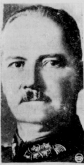
In charge of the Nazi commission which will see that terms of the Franco-German armistice are enforced in France, is Gen. Joachim von Stuepnigel.