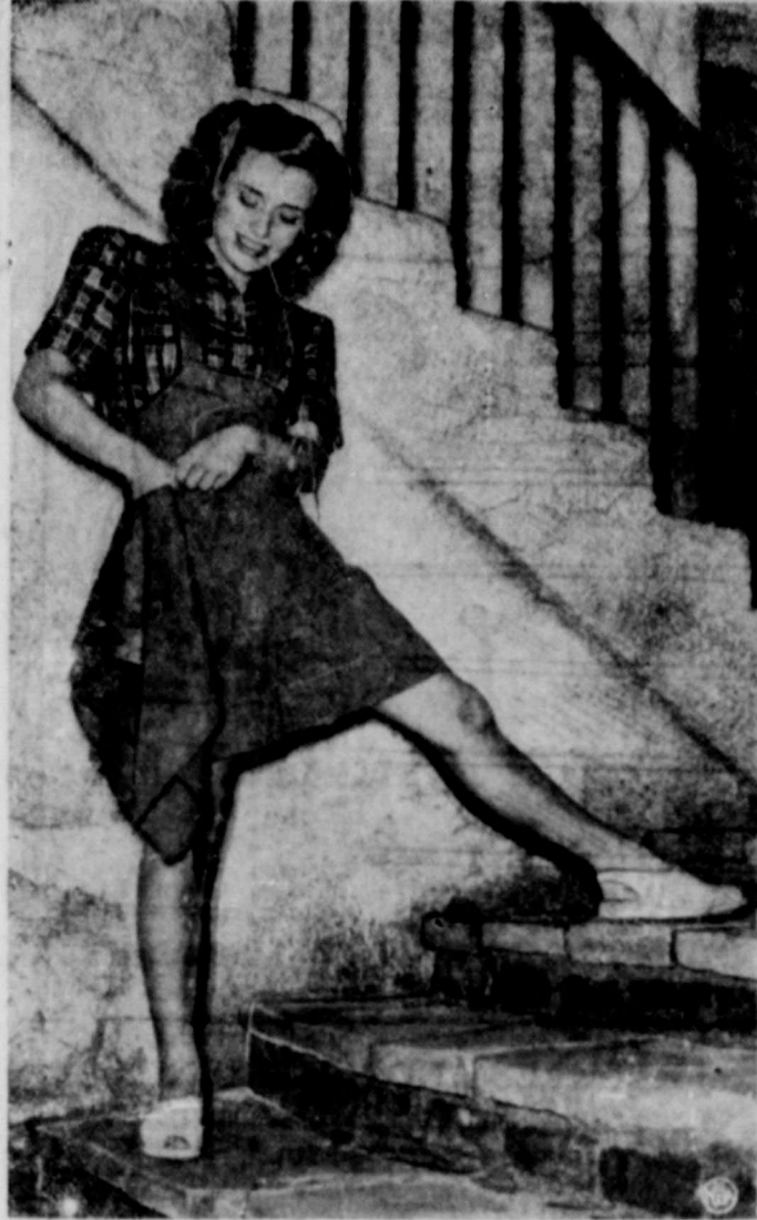
Priscilla Lane, pretty motion picture star, models a suspender playsuit—just the thing for a weekend in the country. It includes green suspender shorts in the new longer length, a matching green jacket and a gingham shirt in red, green, blue and yellow plaid. Jacket and shorts are hand-stitched in ivory yarn.