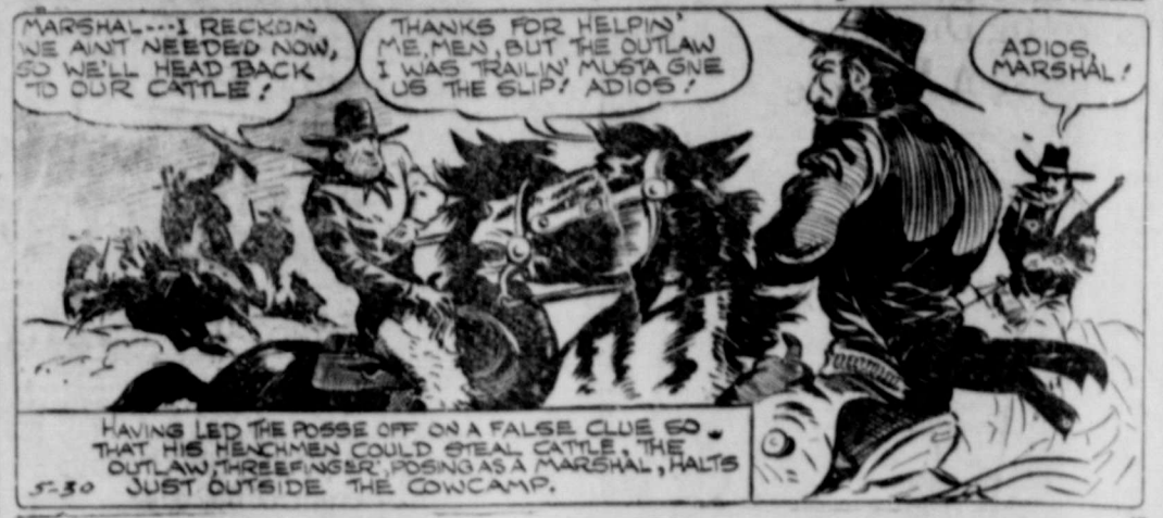
HAVING LED THE POSSE OFF ON A FALSE CLUE SO THAT HIS HENCHMEN COULD STEAL CATTLE, THE OUTLAW THREEFINGER, POSING AS A MARSHAL, HALTS JUST OUTSIDE THE COWCAMP.