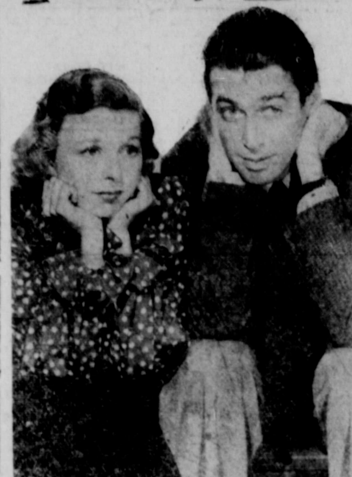
Margaret Sullivan and James Stewart, currently appearing at the Arcadia in "The Shop Around the Corner."