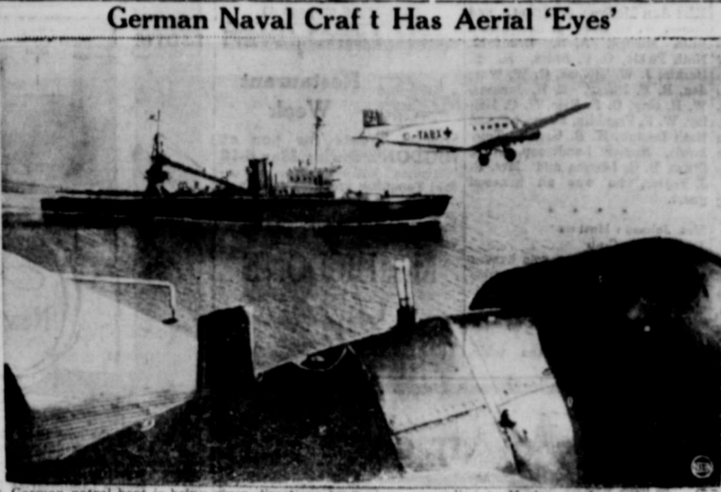
A German patrol boat is being given directions by a plane, according to Nazi censor's report on above picture. A unit of the Sea Salvage Corps, the ship has large crane for aiding disabled vessels.