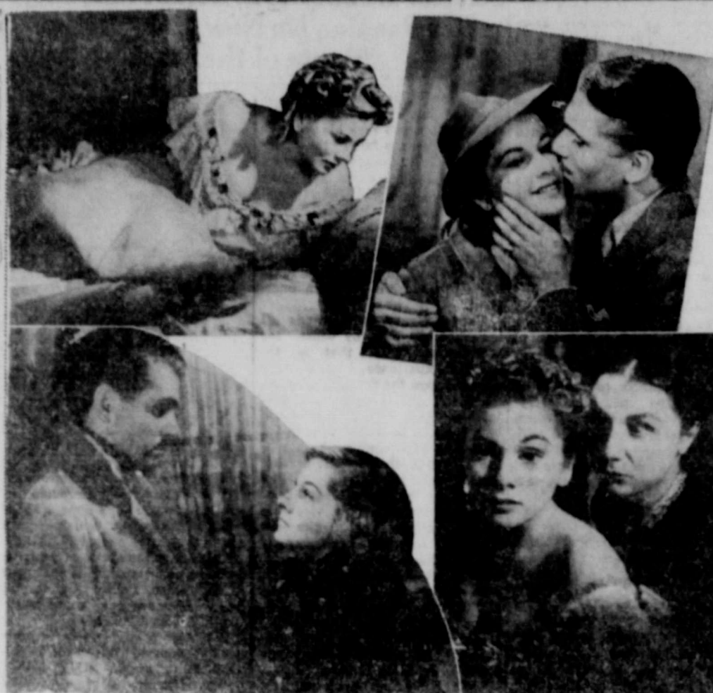
Scenes above are from the screen adaptation of Daphne Du Maurier's best selling novel "Rebecca," which comes to the Arcadia theatre for two days beginning today. Top left is Joan Fontaine as the mistress of Tudor estate. Top right and lower left Miss Fontaine is shown with Laurence Olivier, castas Mamix de Winter. Lower right Judith Anderson, as the housekeeper at Manderley exercises a sinister influence over Joan Fontaine. "Rebecca" was produced by fabulous David O. Selznick, producer of "Gone With the Wind."