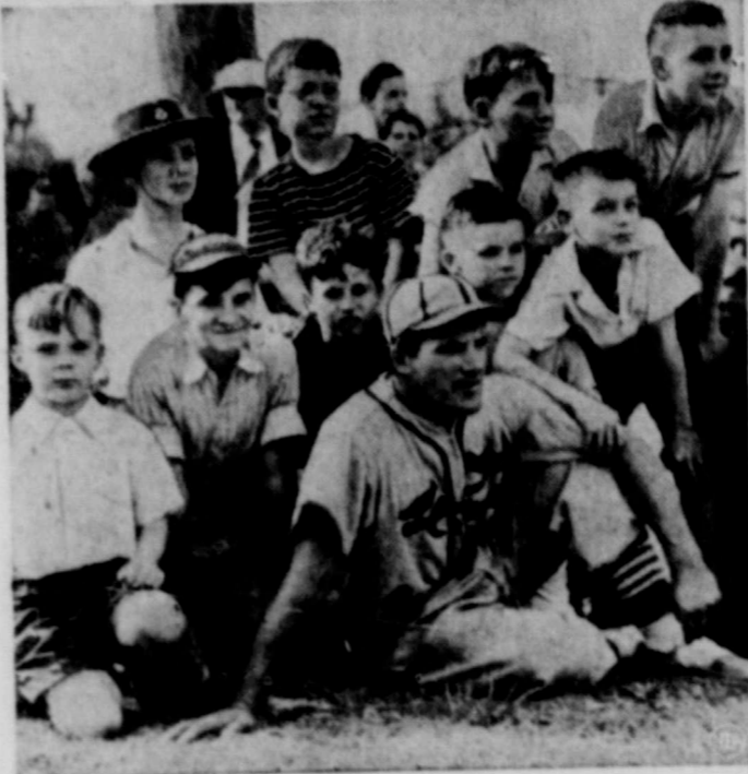
There was no question who the kids' hero was while the slugging outfielder, Joe Medwick, was not in the lineup of the St. Louis Cardinals in exhibition games.