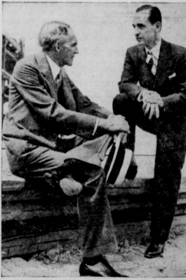
Henry Ford and Edsel Ford keep daily personal touch with all phases of Ford manufacture. In a conference with his staff, Henry Ford often says: "Go ahead—I'll sit here and represent the public."

The Ford Motor Company was founded by a working-man for working-men. Its present officers began as employees of the Company. It was the first company to pay a minimum wage, beginning in 1914, at the then astounding figure of $5 a day. That was double the prevailing wage of the time. The Ford minimum is now $6 a day for all employees engaged in production work. And from that, the wages rise to $10.80 a day, with the average wage $7.25, exclusive of salaried employees.