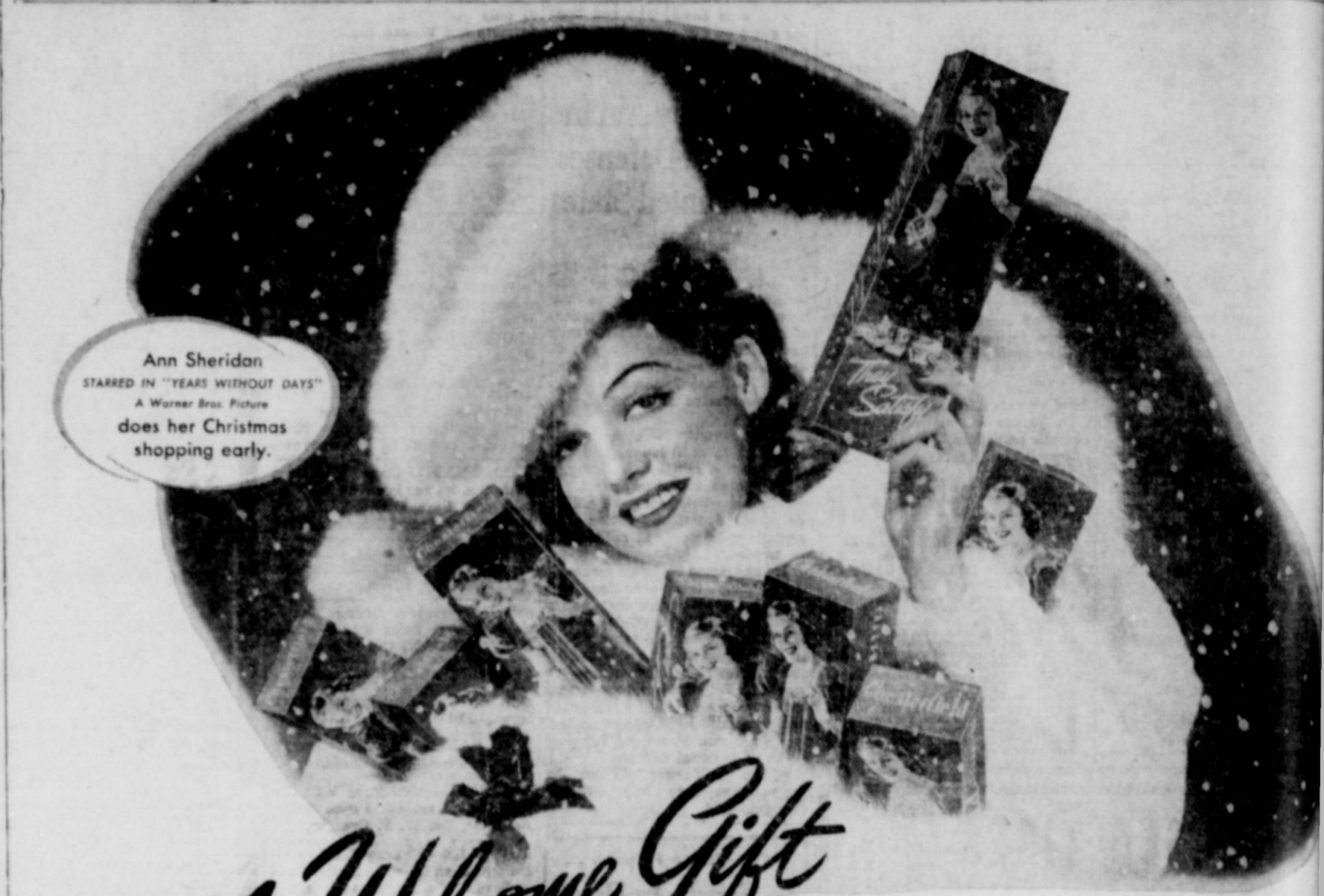
Ann Sheridan STARRING IN "YEARS WITHOUT DAYS" A Warner Bros. Picture does her Christmas shopping early.