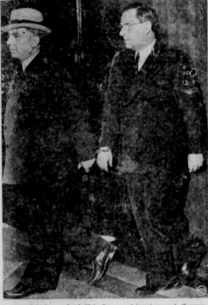
Sentenced to two-and-a-half to five years' imprisonment, German-American Bund fuhrer Fritz Kuhn is tight-lipped as, handcuffed to a detective, he is led to a cell. Kuhn was convicted of grand larceny and forgery in connection with misuse of Bund money.