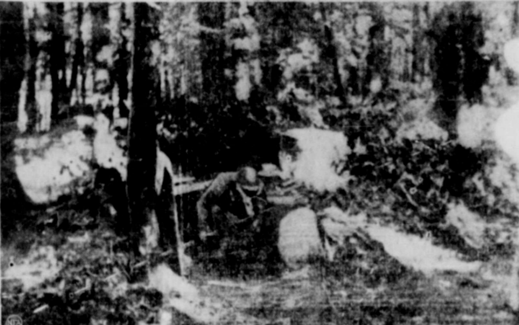
French soldier emerges from dugout in wooded section "somewhere on Western Front" to observe fall in general quiet that prevails on Franco-German battlefields. Photo shows the nature of the woods in which most of the Western Front patrol fighting has been carried on.