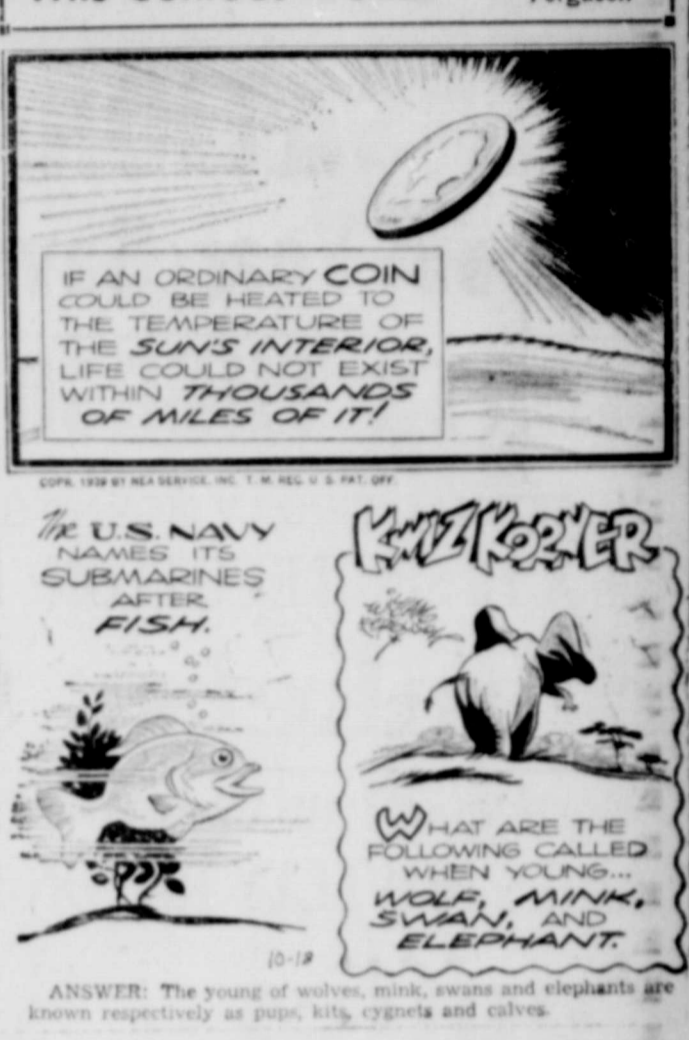
ANSWER: The young of wolves, mink, swans and elephants are known respectively as pups, kits, cygnets and calves.