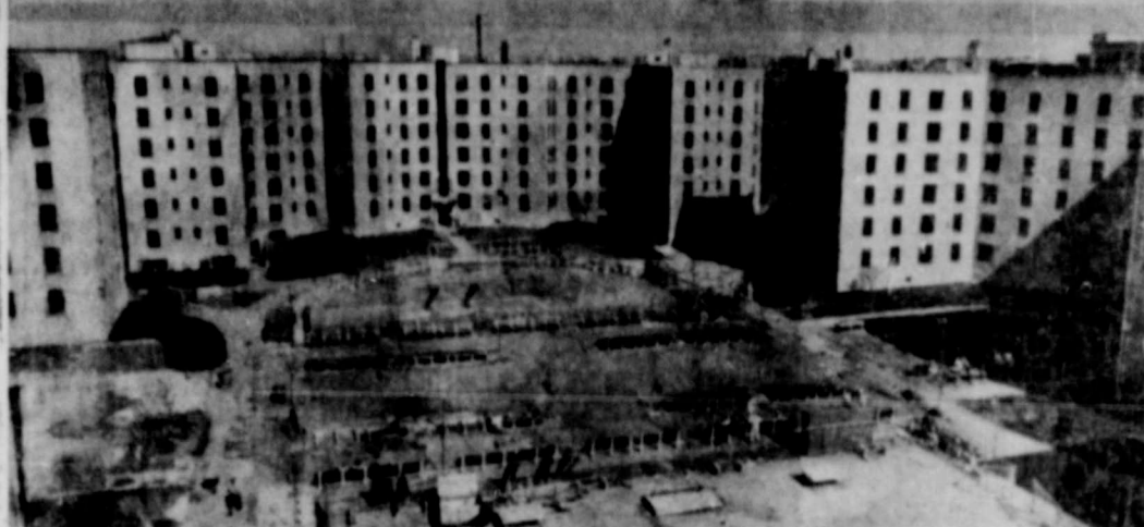
When "Queenbridge Houses," New York Housing Authority's giant low-cost project on Long Island, is formally dedicated on October 25, largest development of its kind in the U. S. will be in operation. Above, some of the 26 buildings where, it is estimated, 11,400 persons will dwell when the 2149 apartments are rented. First cost estimate of $16,000,000 was cut to $13,500,000, despite 600 additional apartments not contemplated in original plans.