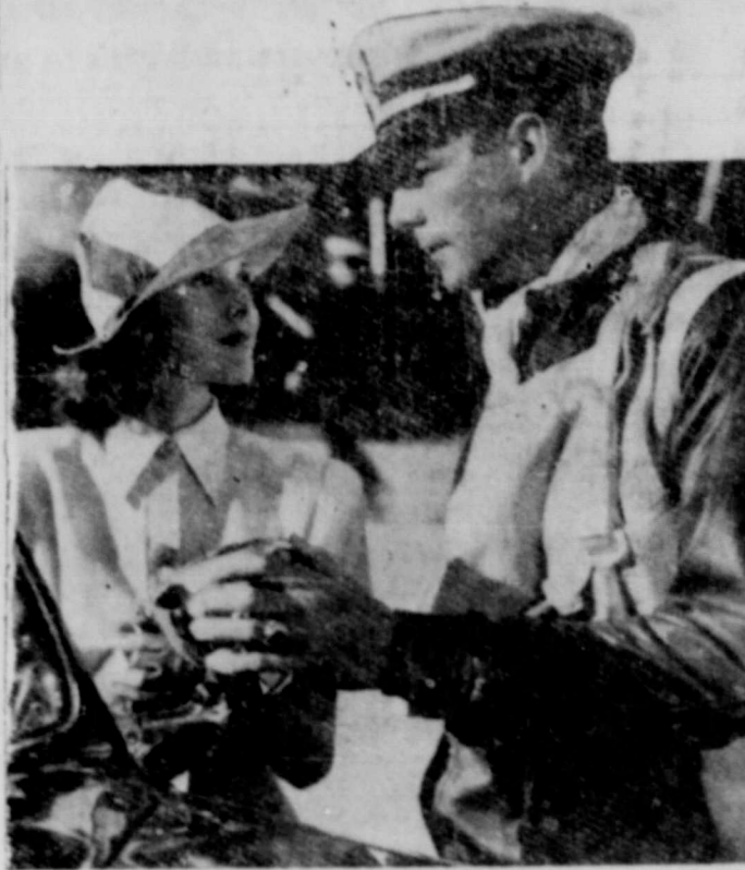
Above we see the lovely Frances Dee and Randolph Scott in a scene from Columbia's "Coast Guard," in which they are supported by Ralph Bellamy and Walter Connolly, now playing the Arcadia theatre.

Hitler finds his peace offers have little effect in ending the war. Of course, he could go climb his mountain and just ignore the whole thing.