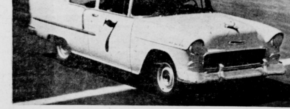
Great Features back up Chevrolet Performance: Anti-Dive Braking-Ball-Race Steering-Outrigger Rear Springs - Body by Fisher - 12-Volt Electrical System - Nine Engine-Drive Choices.

Every checkered flag signals a Chevrolet victory in official 1955 stock car competition—not only against its own field but against many American and foreign high-priced cars, too!