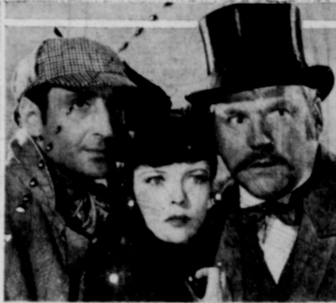
Above are Basil Rathbone, Ida Lupino and Nigel Bruce in 'The Adventures of Sherlock Holmes,' 20th Century-Fox's unsurpassed mystery thriller of all time, coming at the Arcadia theatre tomorrow.