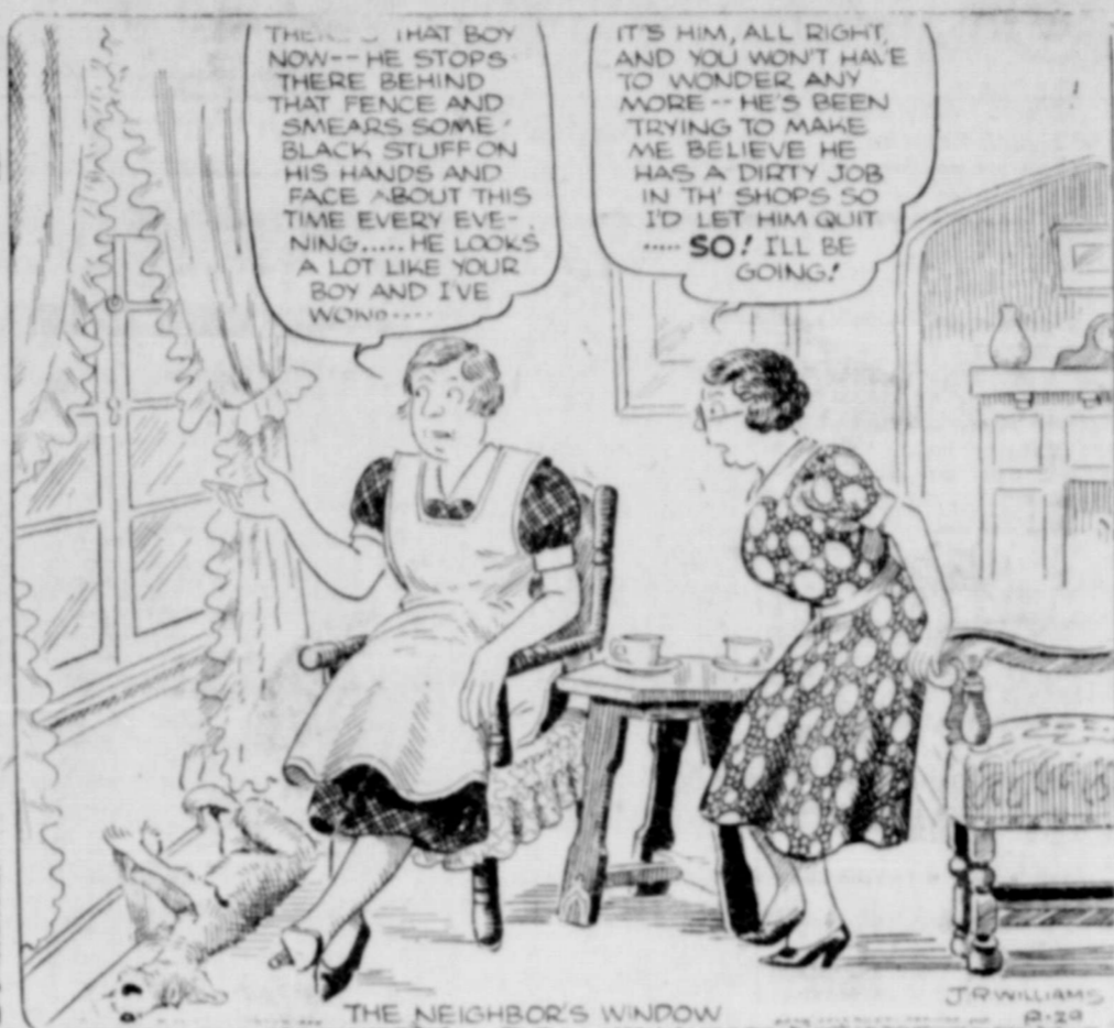
THE NEIGHBOR'S WINDOW