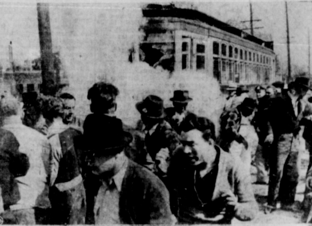
Repulsed by tear gas barrage, laid down by deputy sheriffs, pickets flee scene of attack on street car, carrying office workers to strikebound Allis-Chalmers plant at West Allis, Wis. Pickets smashed car windows, roughed non-strikers. Thirteen were injured in rioting.