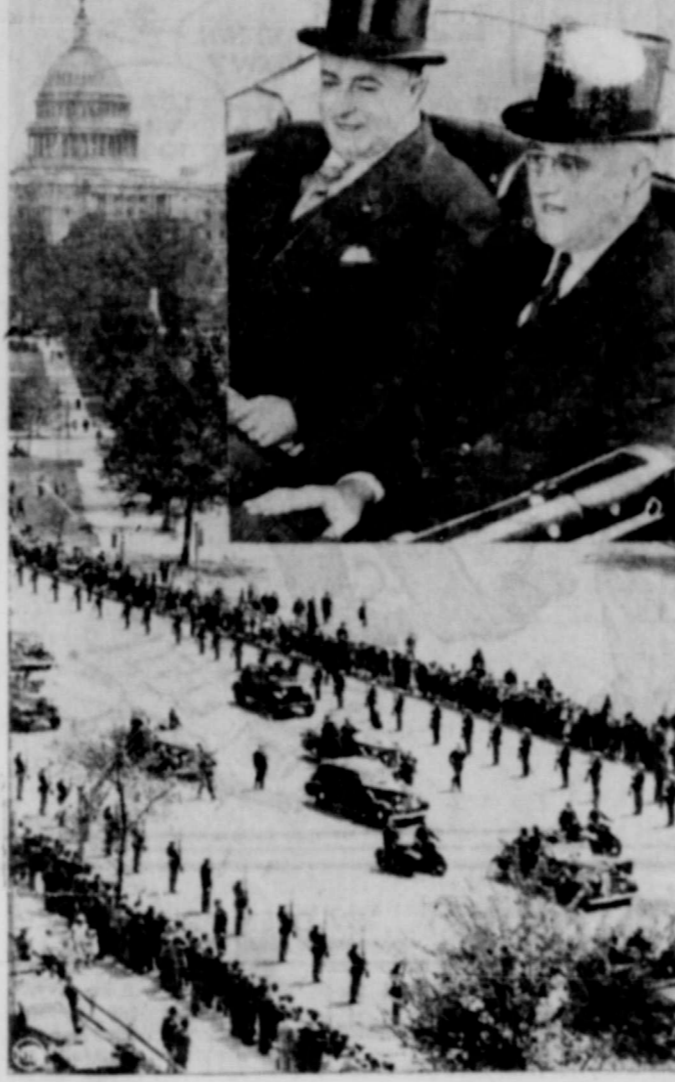
Washington put on one of its greatest shows for visiting President Somoza of Nicaragua. Upper right, President Roosevelt and President Somoza are shown as they rode together in parade. Lower, bird's-eye view of the procession down Pennsylvania avenue.