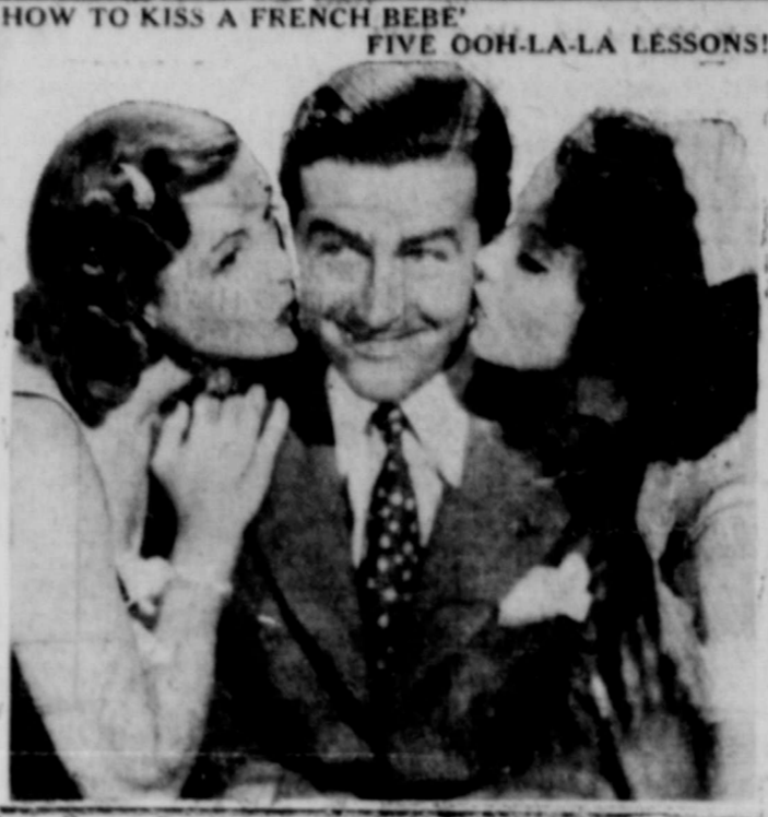
Irone Harvey, Ray Millard and Olmpe Branda in a scene from "Say It In French," Paramount's gay comedy now playing at the Arcadia theatre

HOW TO KISS A FRENCH BEBE' FIVE OOH-LA-LA LESSONS!