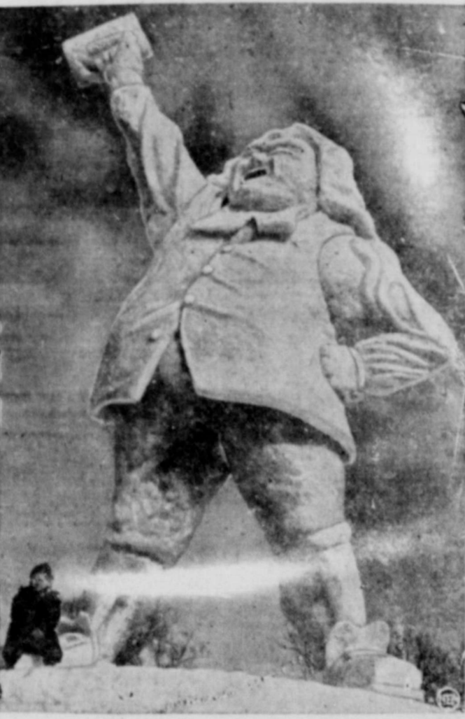
Favorite subject of undergrad ice sculptors at Dartmouth College's annual Ice Carnival is Eleazer Wheelock, founder of the Hanover, N. H., school. Dominating the campus this year is the huge 26-foot 6-inch statue above.