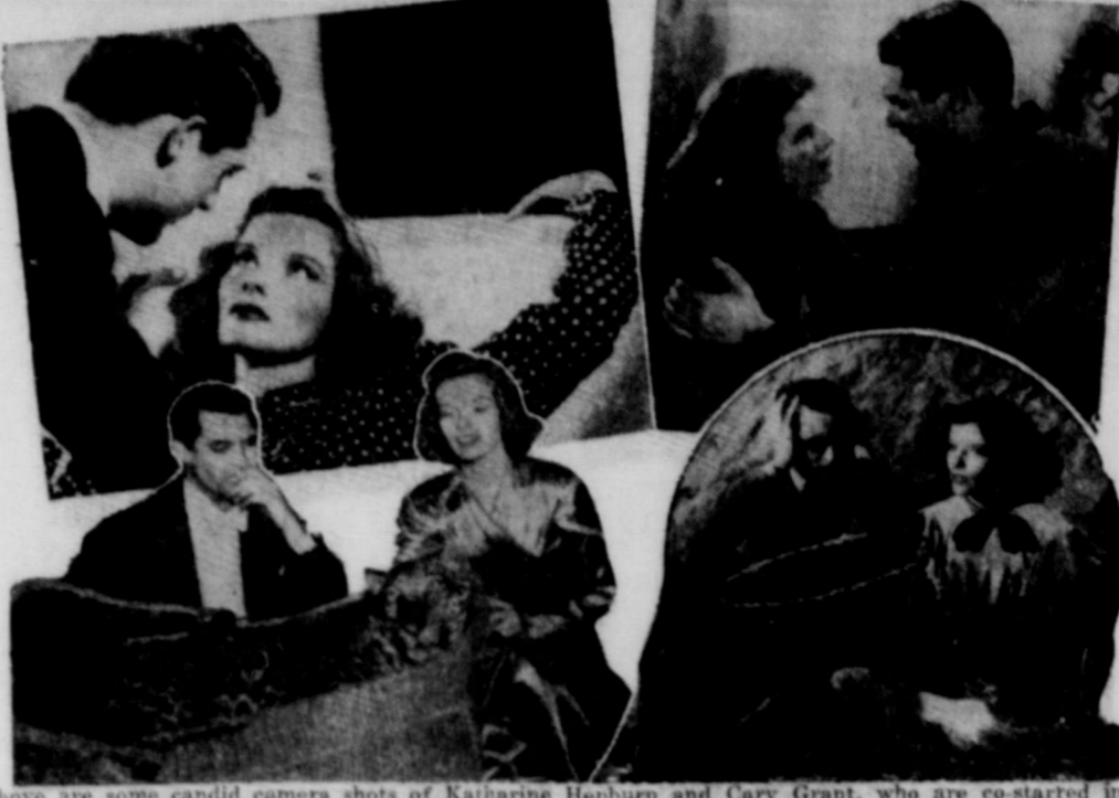
Above are some candid camera shots of Katharine Hepburn and Cary Grant, who are co-started in 'Bringing Up Baby'...