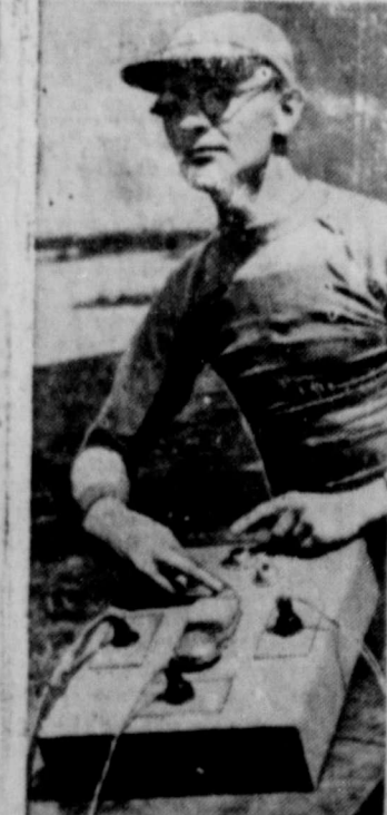
Playing baseball by sound is the method by which inmates of the Industrial Home for the Adult Playing baseball by sound is the method by which inmates of the Industrial Home for the Adult Blind in Oakland, Calif., enjoy the sport. Above left, is an action scene from a game played on a regulation-size softball diamond equipped with yard-square bases and yard-wide carpeted base lines. The ball is rolled to the batter, who swings at it with an outdoor hockey stick. Right, is the umpire, who acts as the eyes for both teams. He guides all the players by a system of bells and buzzers. The batter feels his way around the bases on the carpeting, while the fielders, on hands and knees, attempt to locate the ball and roll it in front of the runner's path to score the putout.