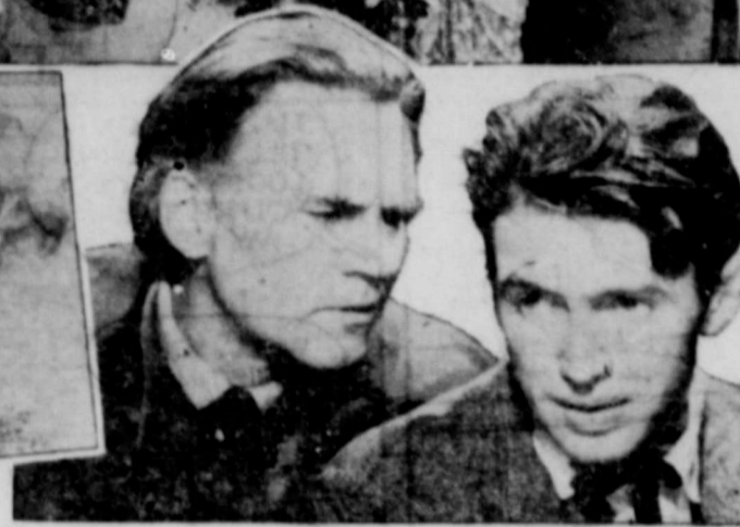
Above are scenes from "Of Human Hearts" Metro-Goldwyn-Mayer's screen masterpiece, which will be the attraction at the Arcadia Theatre today only. In the top section, left to right, we see James Stewart and Ann Rutherford and then Guy Kibbee, Beulah Bondi and Walter Huston. In the lower left hand section is a scene from one of the Civil War battle sequences. In the lower right hand corner is Walter Huston and James Stewart.