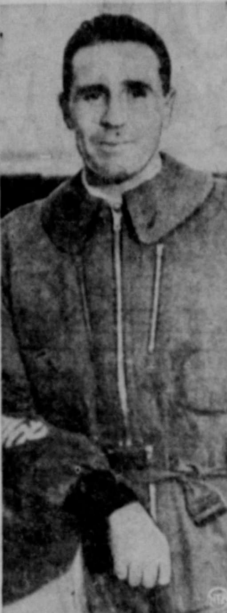
Premier Mussolini has provided Ethiopia with a royal governor to succeed militant General Ruffalo Graziani. The viceroy of Italy's biggest colony is Prince Amedeo Umberto, above, of Aosta Savoy, general of the air corps and one of the men who aided in the conquest of Haile Selassie's land.

gaining strength in 1905 when the Forestry Service was established and was celebrating its 172nd birthday in 1908 when Forest County was organized. The CCC in 1933 found the lone pine 197 years old but the woodsman did not spare the giant.