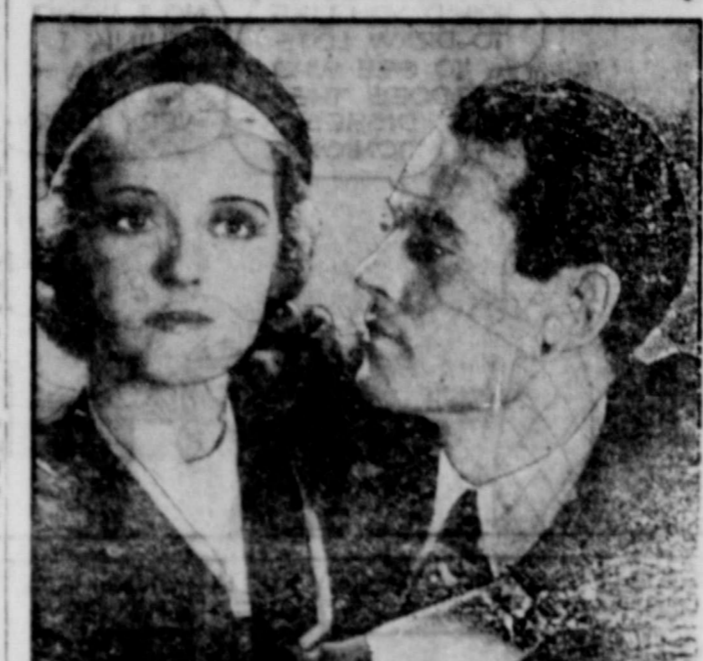
Bette Davis and Henry Fonda, coming to the Arcadia today only, in "That Certain Woman."