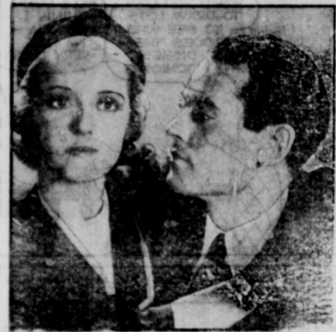
Bette Davis and Henry Fonda, coming to the Arcadia today only, in "That Certain Woman."