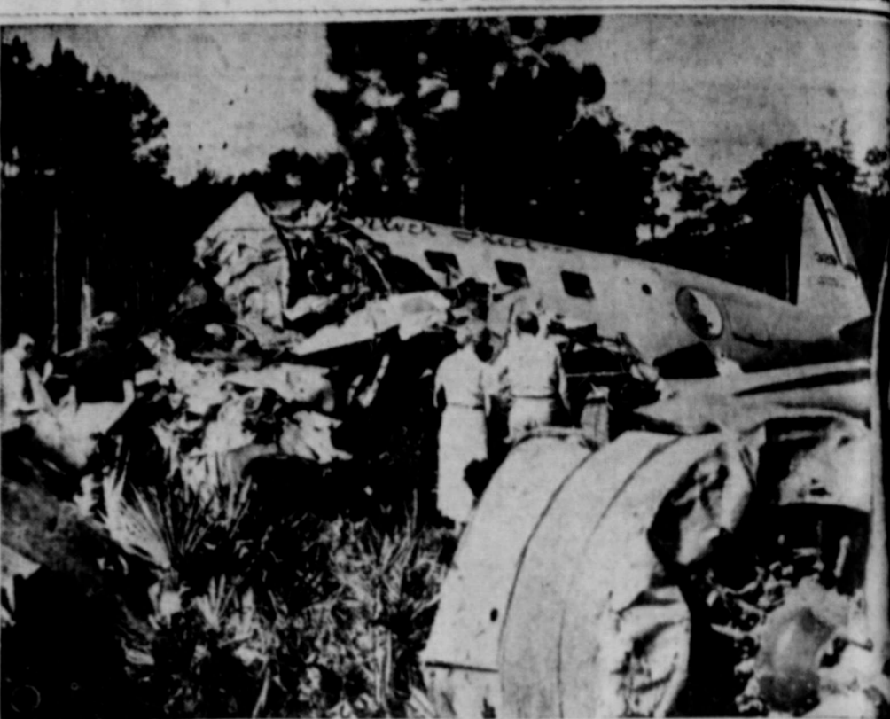
Seeking to determine responsibility for the accident in which four persons lost their lives, authorities have launched a three-way investigation of the air disaster at Daytona Beach, Fla., where an Eastern Air Lines transport plane crashed to earth in an early dawn takeoff. The wreckage is shown above, ship accidentally struck a newly strung power line and hurtled to the ground.