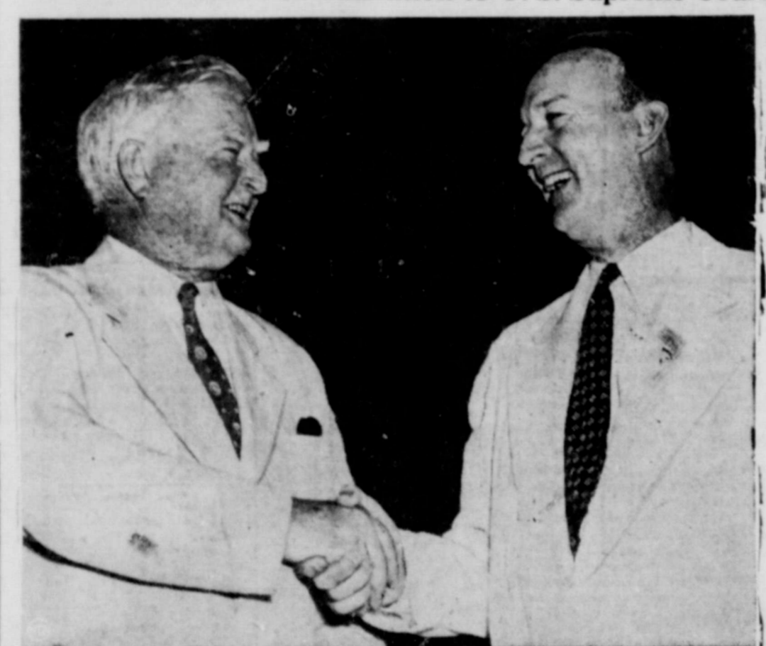
Smiles were in order as Senator Hugo L. Black of Alabama, right above, President Roosevelt's nominee for the Supreme Court, received hearty congratulations from Vice President John Nance Garner. The selection of the liberal southern leader of the Education and Labor Committee came as a surprise to the Senate.